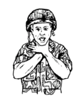
Figure 2-18. Universal sign of choking.

• Get help, administer Abdominal Thrusts