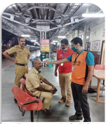
Figure 6 screening by IAG volunteers at railway station

IAG member Organisations (NGOs) in Kollam district who are active in COVID 19 response: 1) QSSS, 2) SAFE,3) Kollam, 4) Civil defence Kollam,5) AARS Kollam,6) Iyline foundation, 7) Sevabharathi, 8) Emergency response team, 9) TRACK, 10) SYV