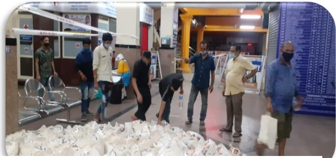
Figure 21 Food kit preparation by IAG volunteers