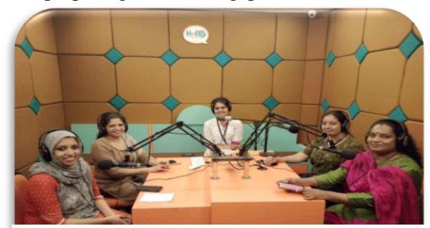
Figure 17 Awareness Creation through FM radio

various languages, including Hindi, Bengali, Assamese, and Odiya to sensitise the guest workers on deadly