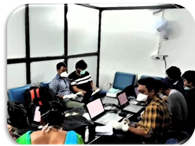
Figure 3 IAG volunteers at district help desk

and others came forward to do their bit to help the district authorities to mitigate the risk of COVID -19. Many are deployed at the district call centres, ambulance desk and DISHA (COVID -19 care) helpline. The volunteers prepared the database of the passengers arriving at the airport. Three teams comprising 10 volunteers worked in shifts at the airports to collect and upload details. Over 600 volunteers came forward to assist various departments including district medical office and district administration. Volunteers talks to the passengers arriving at the airport and hand over their details to the district administration and medical office. Deputy Collector (Disaster Management) Shri Anu S Nair said that volunteers have been actively taking part