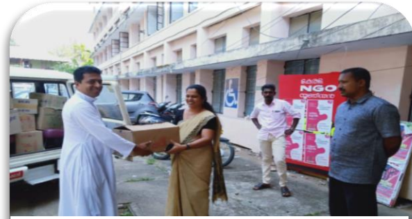
Figure 12 IAG Convener handed over face masks to district administration

IAG member Organisations (NGOs) in Pathanamthitta district who are active in COVID 19 response: 1) DISHA, 2) Anugraha Social Service Society, 3) Bodhana-Thiruvalla Social Service Society, 4)Indian Red cross society, 5) P.N Paniker foundation