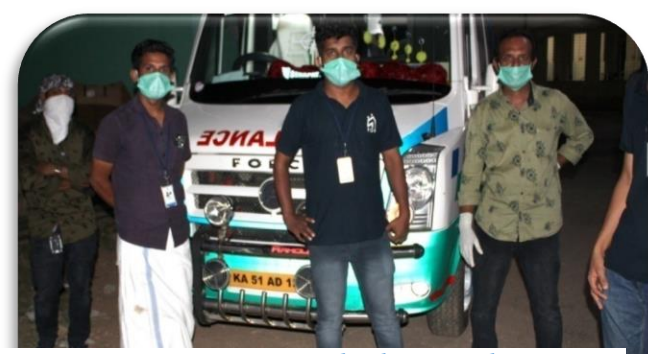
Figure 20 Emergency medical support by IAG volunteers

IAG member Organisations (NGOs) in Palakkad district who are active in COVID 19 response: 1) Youth of Palakkad, 2) SYS, 3) Truma Care 4) Yuvatha, 5) Prathikaranavedi 6) NYK 7) Red Cross International 8) IRW, 9) Team welfare, 10) Civil Defence