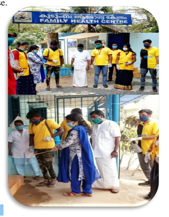
Figure 9 Action by ADRF Volunteers

One of the major issues identified in the sector assessment is that livelihood were majorly affected due to the pandemic. Many of the costal population are not in the position to engage in their livelihood.