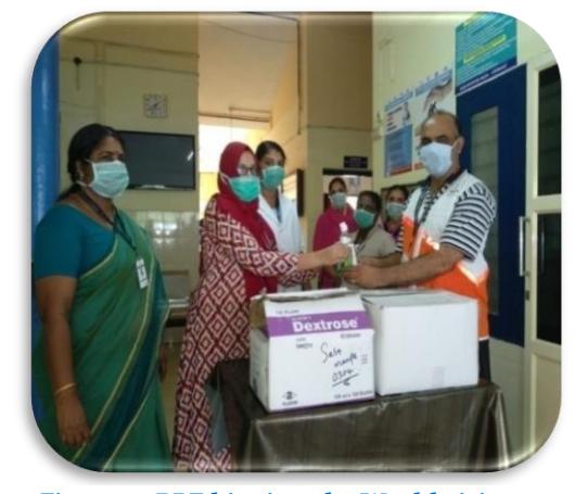
Figure 23 PPE kit given by World vision

IAG member Organisations (NGOs) in Malapuram district who are active in COVID 19 response: 1) ACT ON 2) SYS, 3) Truma Care 4) World vision 5) ERF 6) NYK 7) Kondotty Taluk Dhurantha Nivarana Sena