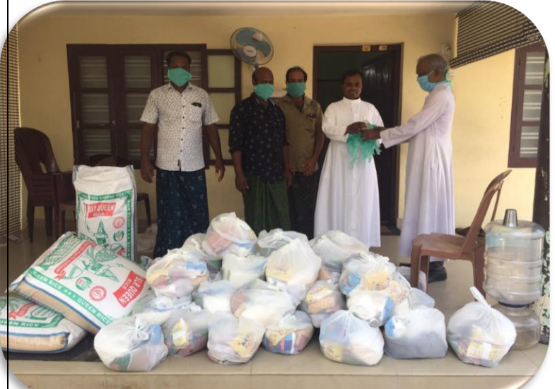
Figure 8 Food kit distributions by ADS

IAG Alappuzha with the support of the member organisations are mobilising volunteers along with distribution