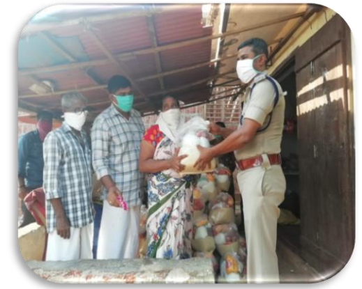
Figure 37 food kit distribution