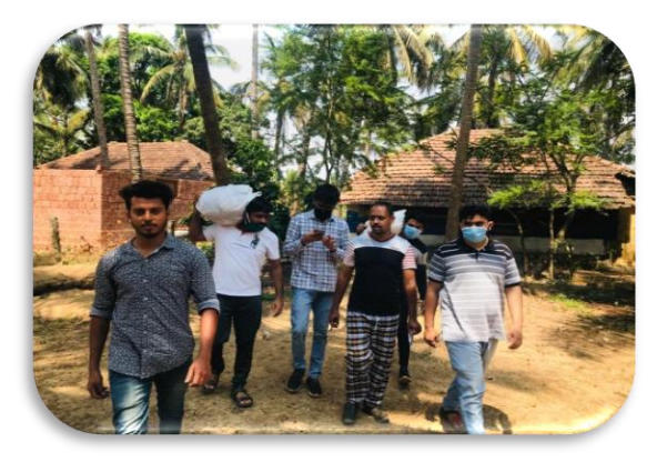
Figure 36 volunteers in action

IAG member Organisations (NGOs) in Kasargod district who are active in COVID 19 response: 1) Health line, 2) Indian red cross society, 3) CDA Chittarikkal, 4) Sandhesam Chowki, 5) Priyadarshini, 6) EVCC, 7) Chandragiri Club Meleparambu, 8) Peoples Mangad, 9) SYS sevana organisation, 10) Cresent Eaivalike, 11) AASE Alampady, 12) Netaji Poinachi,12) KSS Kodavalam, 13) AMMA trust, 14) Youth fighters.