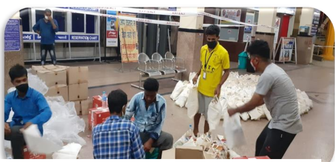
Figure 22 food kit preparation by IAG volunteers