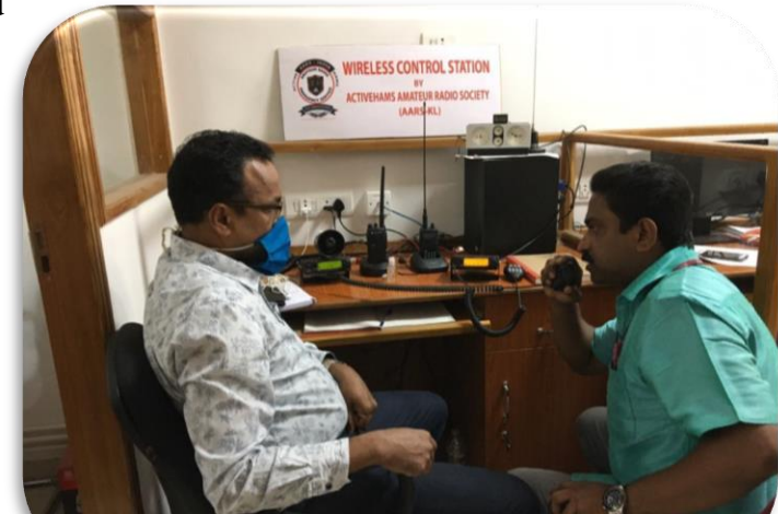
Figure 5 Wireless control station

"Today we have completely isolated the COVID-19 ICU ward with other departments setting up UHF by communication in one of the district medical college, so that we can avoid frequent entry/interaction to common area. Only in emergency situations paramedical staff have to come out to the common areas inside this block and the communication to the medical superintendent too through UHF Hand held device. We have marked all the hand held which are exclusively for COVID-19 ward that will ensure any contamination kind of through Handheld Wireless equipment. This effective method of using UHF inside lab, admin, ICU as well as quarantine areas are the one best practices we identified"