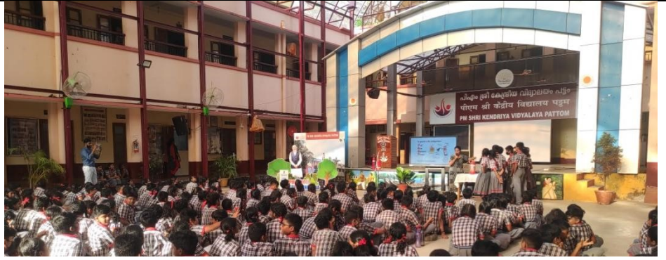
Fig 2: Explaining about fire extinguisher and its proper usage technique.