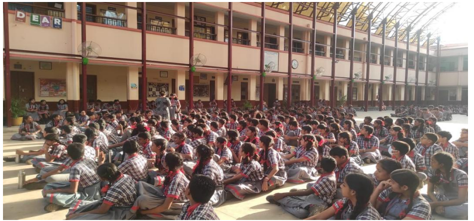
Fig 3: Clarifying the student doubts