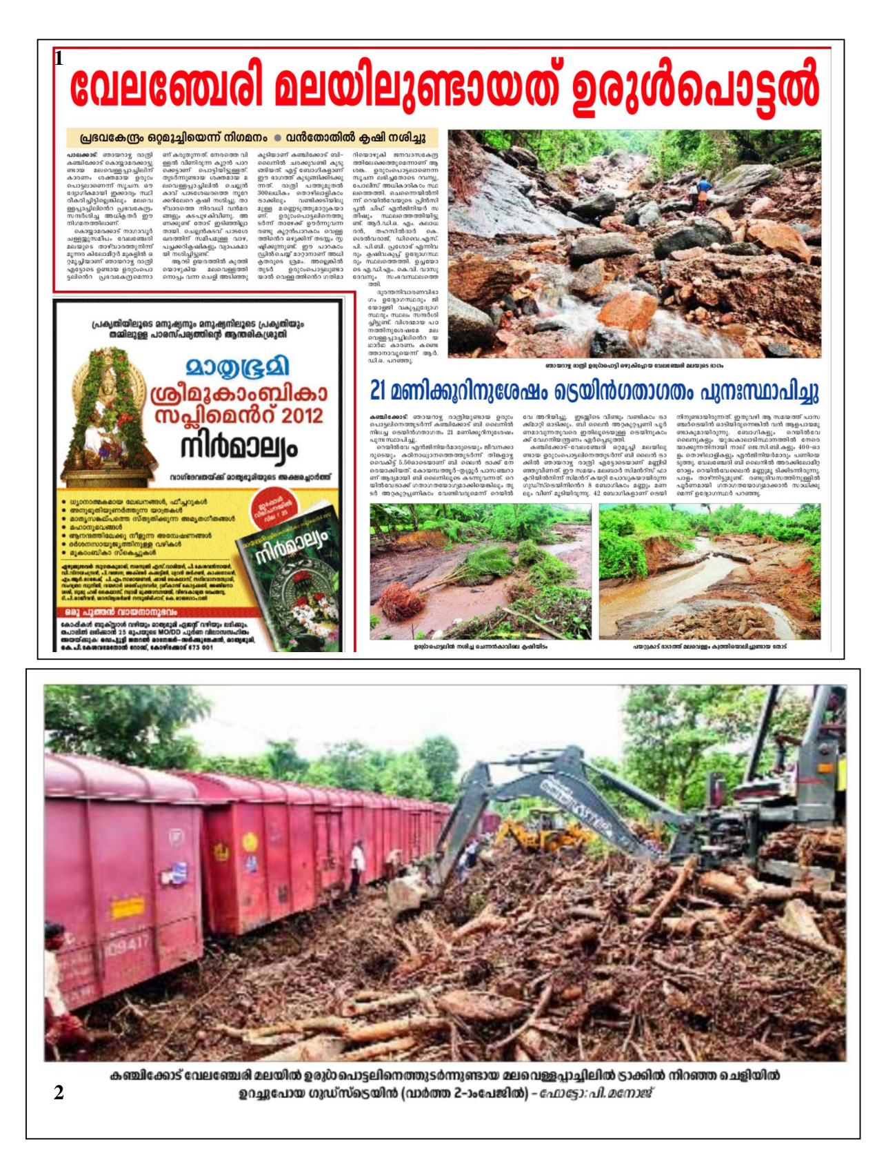
Figure 1 & 2 : News paper cuttings of the Puthusserry events reported.