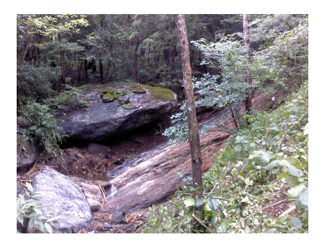
Figure 5: Initiation point of erosion.