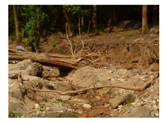
Figure 9: Wooden debris and medium sized boulders over the stream channel.