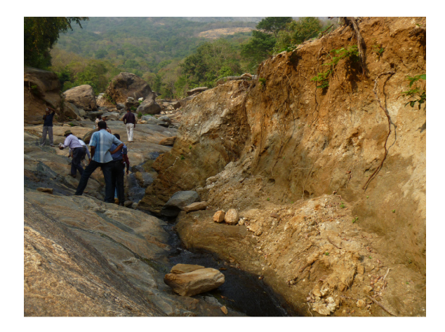
Figure 7: Stream bed and bank erosion. Entire material in the stream bed and 5 meter thick sidewall was also removed.