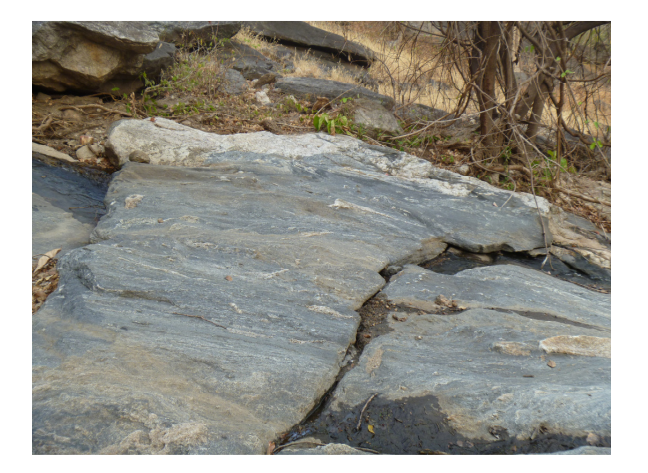
Figure 6: Release joints identified near to the initiation point.