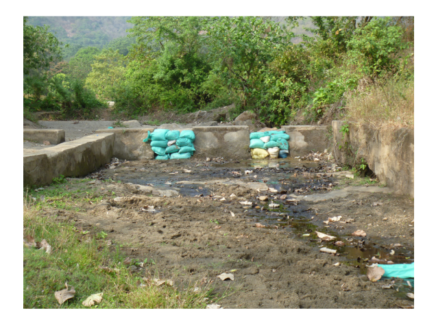
Figure 10: Damaged check dam lower reach of the stream.

Figure 9: Wooden debris and medium sized boulders over the stream channel.