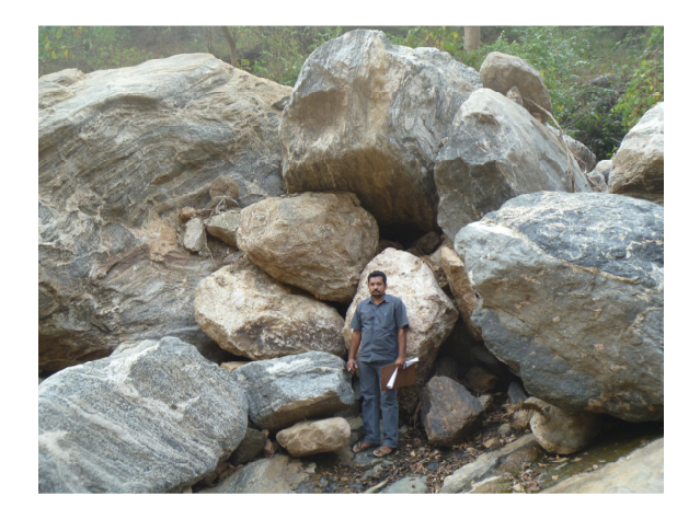
Figure 8: Large boulders deposited in the stream bed.