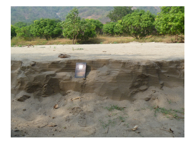
Figure 11: Fine grained sand and silt deposit in the relatively plain area near mango orchard. Note the thickness of the fine grained material deposited with sub-horizontal layering.

electric posts were damaged due to this event. Incoming flood waters along with fine material and tree trunks covered the track. At the time of the event, a goods train which was running to Coimbatore with full load of cement had to be stopped and all water and the slurry which entered into the wagons damaged all the material in the train. Support had to be given to the wagons to prevent derailment. Two days were taken to remove the slurry and muck from the railway line and to repair the damaged railway line and electric posts. The check dam for diverting the water for irrigation purposes was also damaged partly.