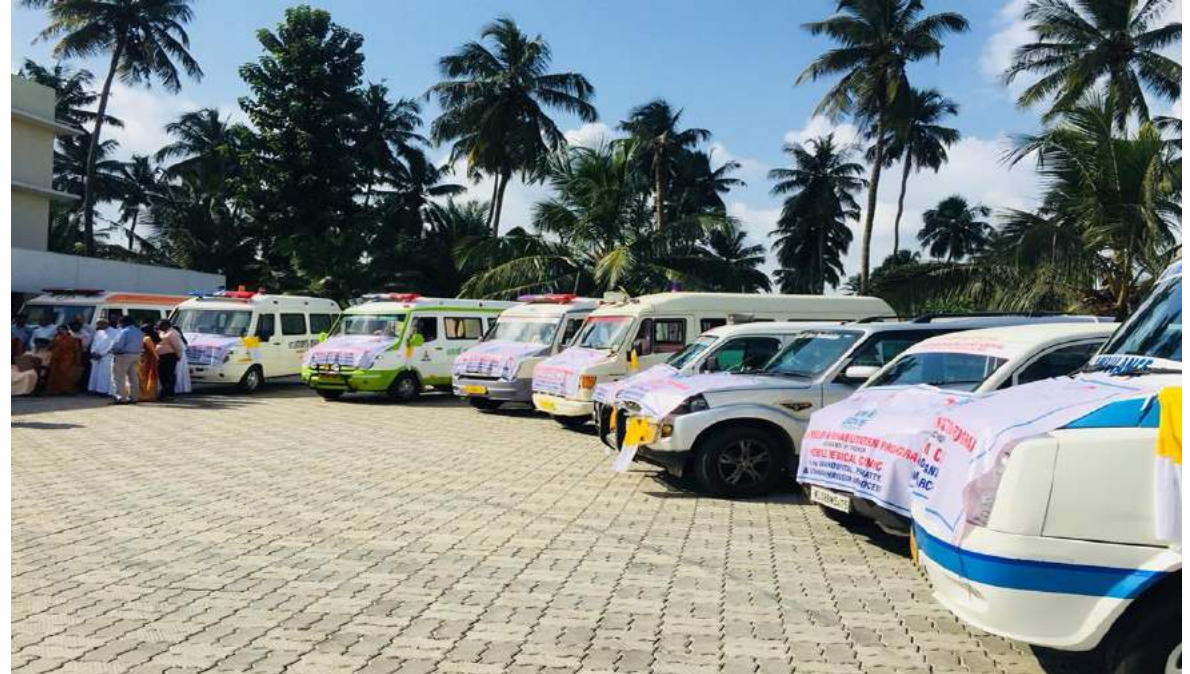
Ambulances of Mobile Clinic at Archbishop's House, Trichur being ready for action

The project of medical support with Mobile Clinics for the people of the flood affected areas was flagged off by the Mayor of Thrissur at Archbishop's House Trichur, in the presence of different civil and ecclesiastical dignitaries on 5<sup>th</sup> September 2018. The project is conducted with the cooperation of 11 hospitals in the archdiocese, including two medical colleges. Every day 16 mobile clinics are conducted with 8 ambulances. The project plans to cover at least 80 locations for approximately 20,000 affected people. The project is done with the cooperation of the local parish priests, sisters and local panchayath authorities.