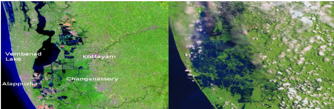
NASA released Satellite image of Kerala before (left) and during flood (right)

2. Floods and Landslides: The flood has been literally devastating to the State, even to the extent of changing the very geographical configuration of the region. Rivers have not only overflowed; some of them have changed their direction too. There were several landslides that washed away the entire families with their houses. All educational Institutions had to be closed down until 29<sup>th</sup> August 2018. The transport and communication systems of the State are also ruthlessly affected. The Airport of Cochin had to be closed down until 29<sup>th</sup> August 2018, since it was filled with waters and mud.