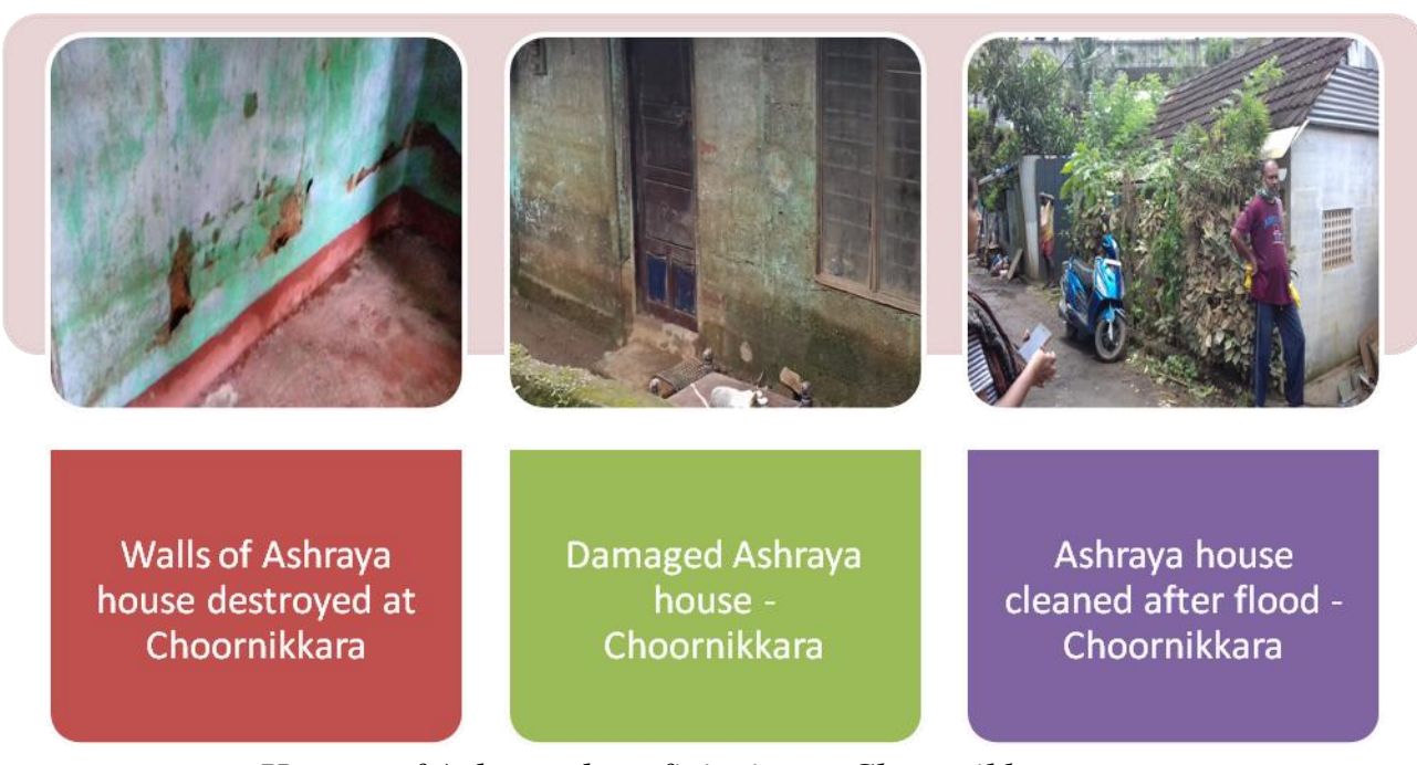
Houses of Ashraya beneficiaries at Choornikkara