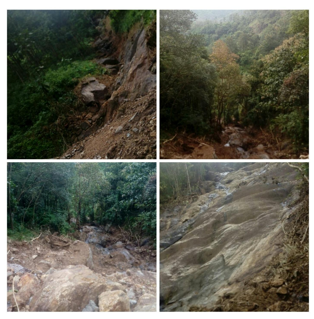
Places affected due to landslides at Theekoy Panchayat - Kottayam