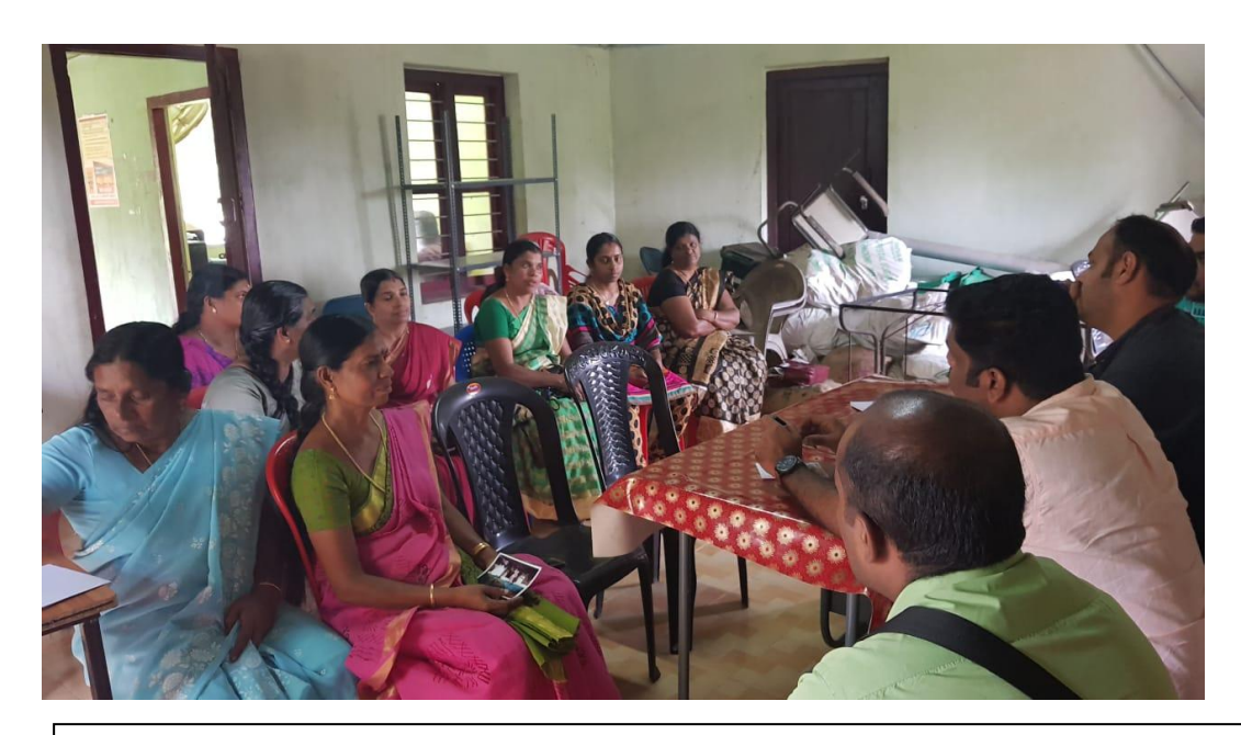
Pic 1. State Team Interacting with Rajakkad CDS Team