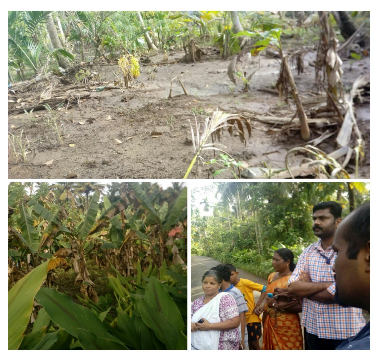
Thalayolaparambu JLG visit.