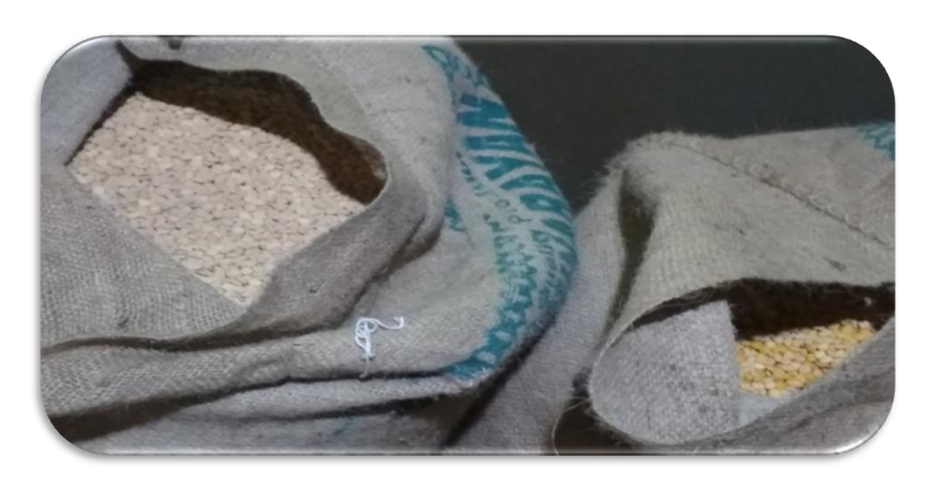
Destroyed Food grains at Amrutham Nutrimix Unit