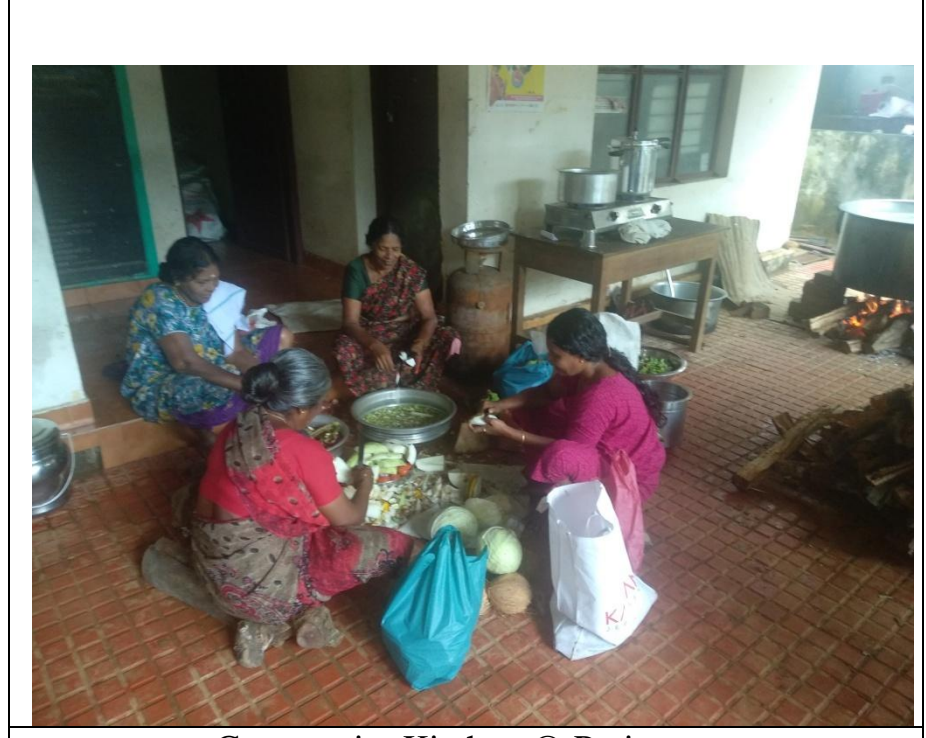
Community Kitchen @ Peringara