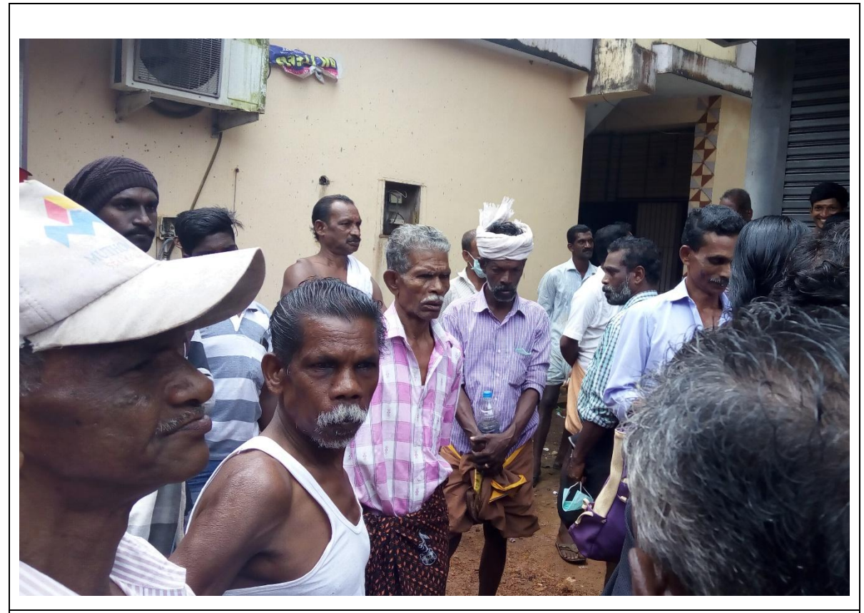
Cleaning Drive @ Peringara