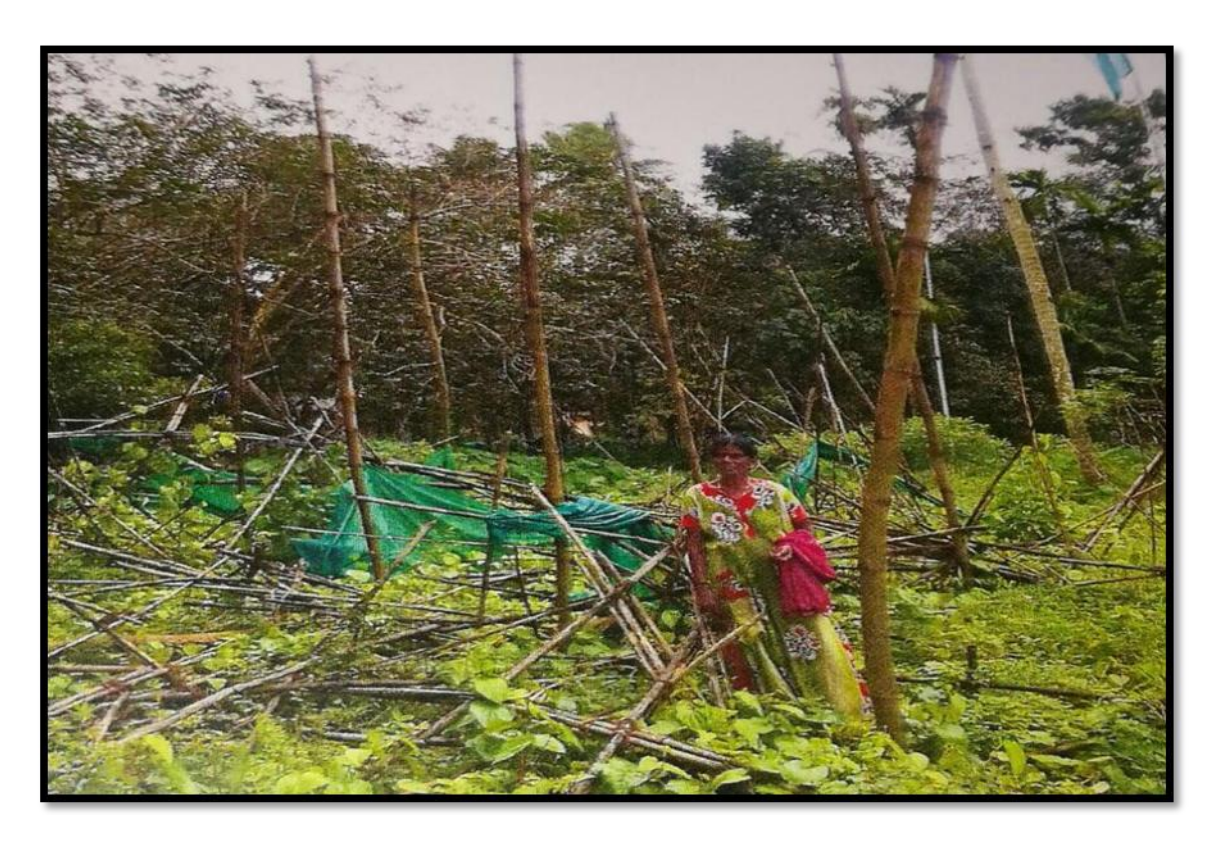
Field affected by flood in Mararikkulam panchayath – Alappuzha