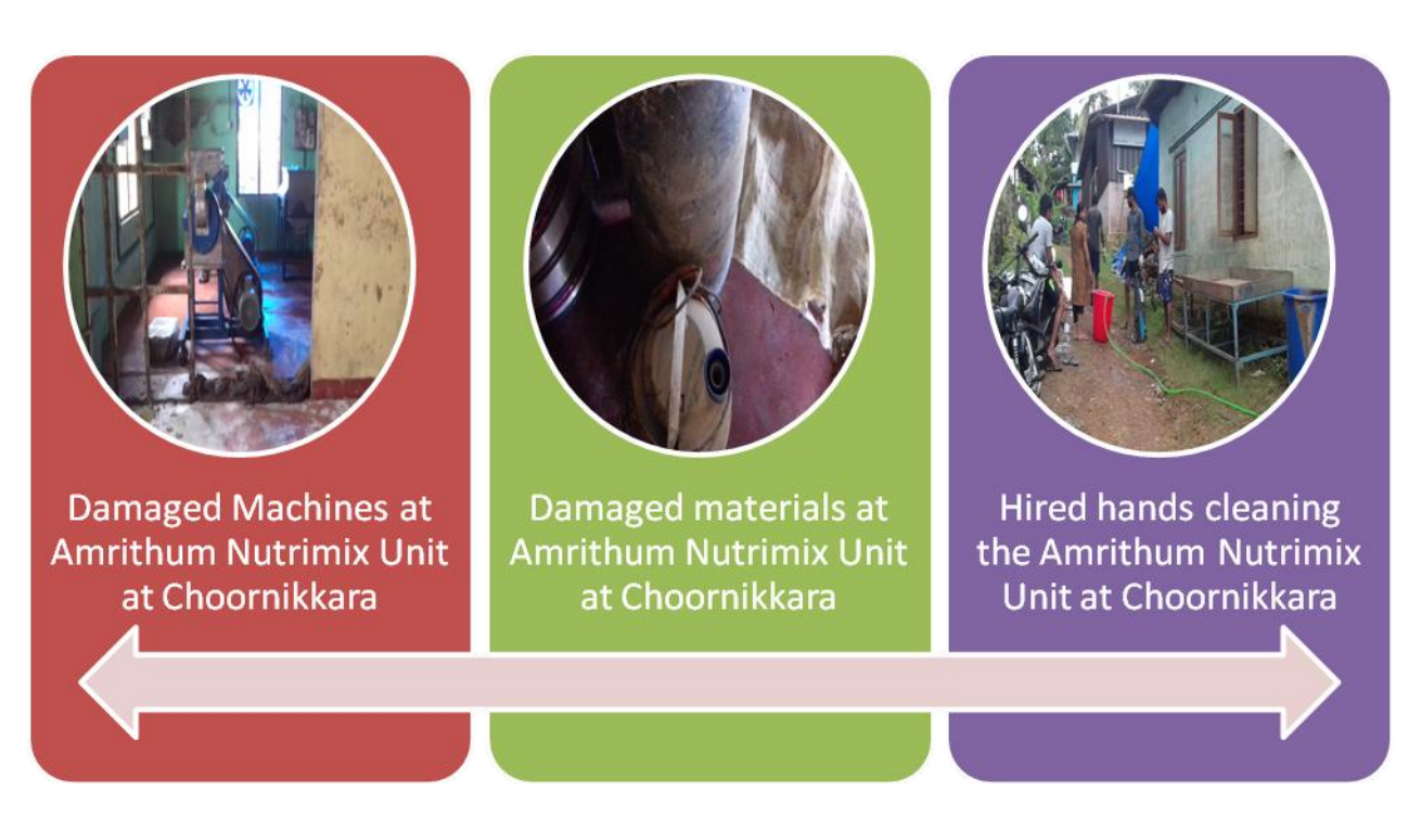
Amrithum Nutrimix Units at Choornikkara