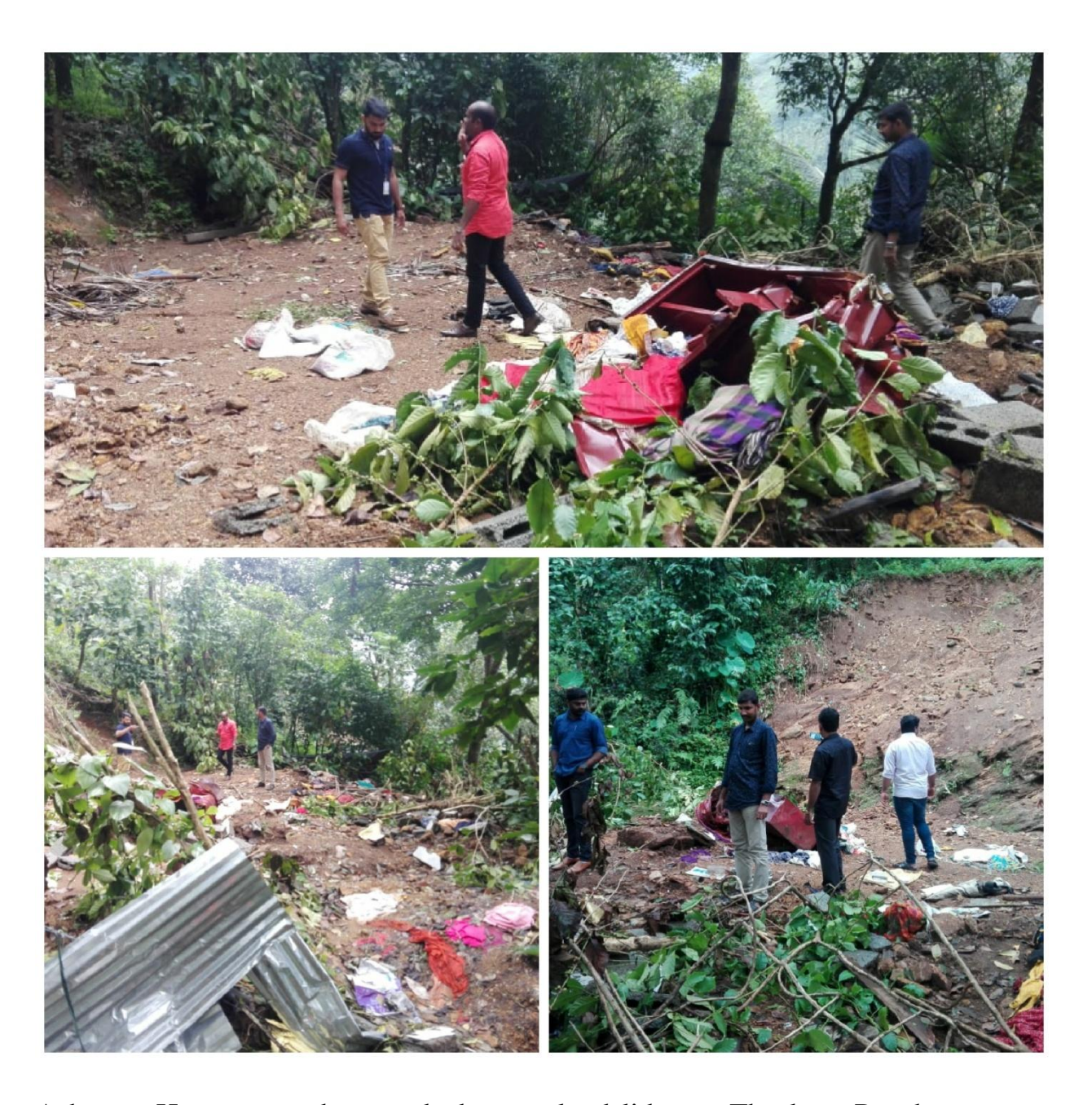
Ashraya House got destroyed due to landslide at Theekoy Panchayat – Kottayam