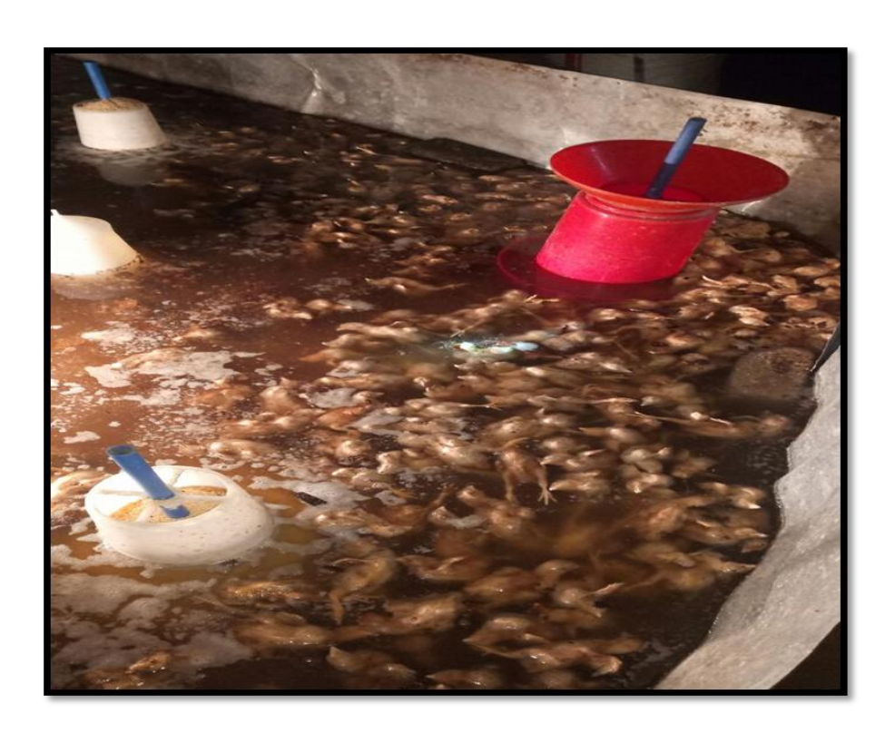
Poultry unit affected by flood