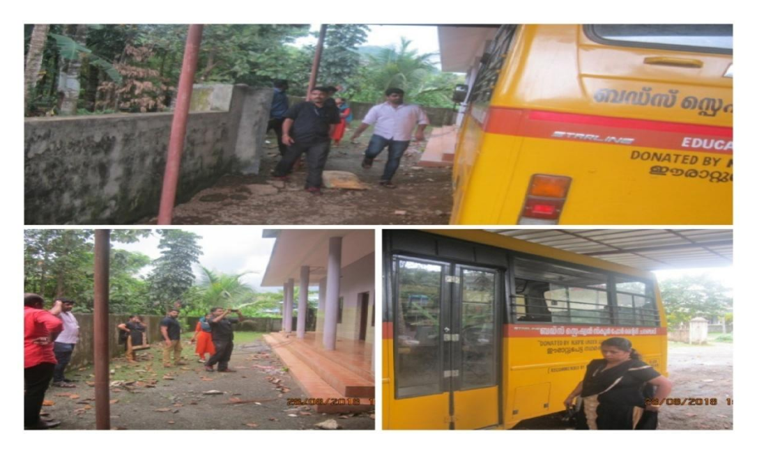
BUDS school visit made by state mission staff at Erattupettah Municipality on 28.08.18