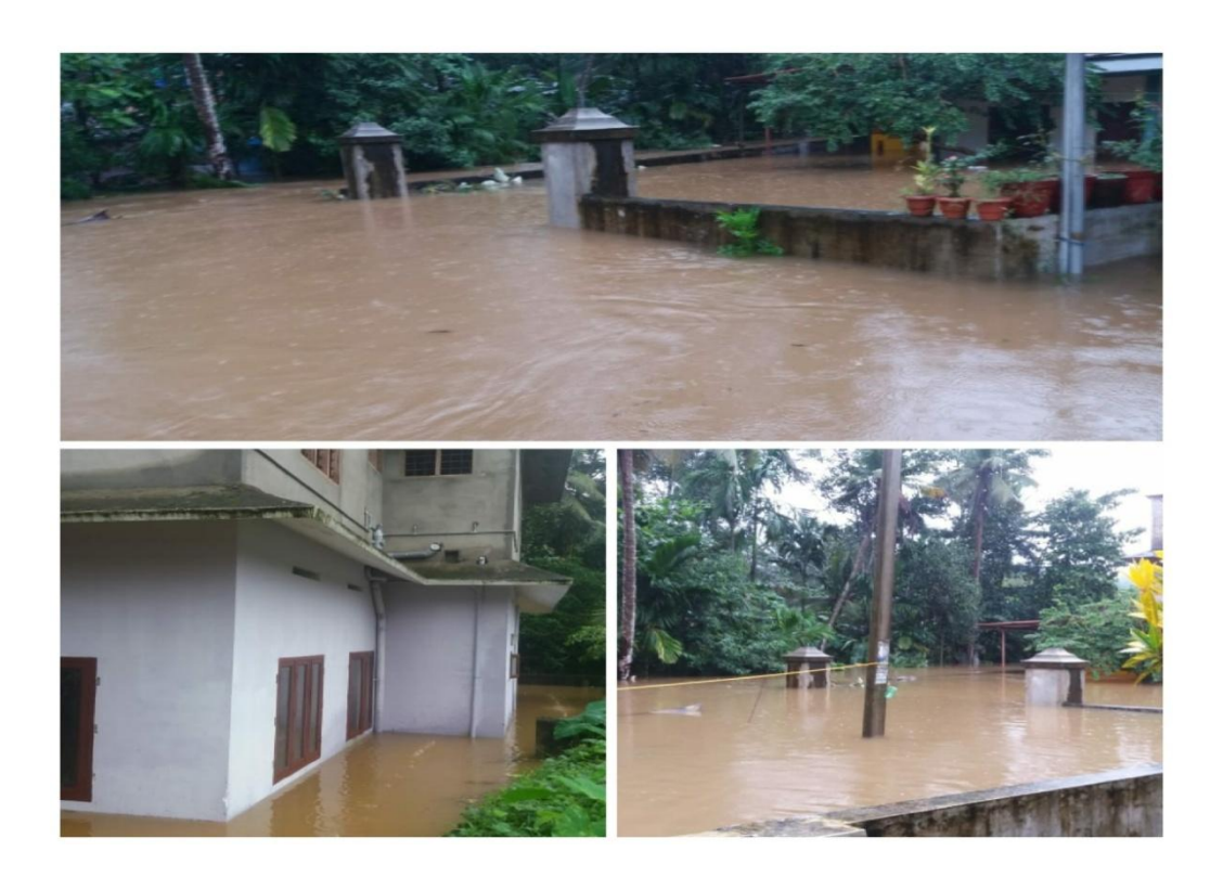
BUDS school at Erattupettah Municipality which was affected by flood.