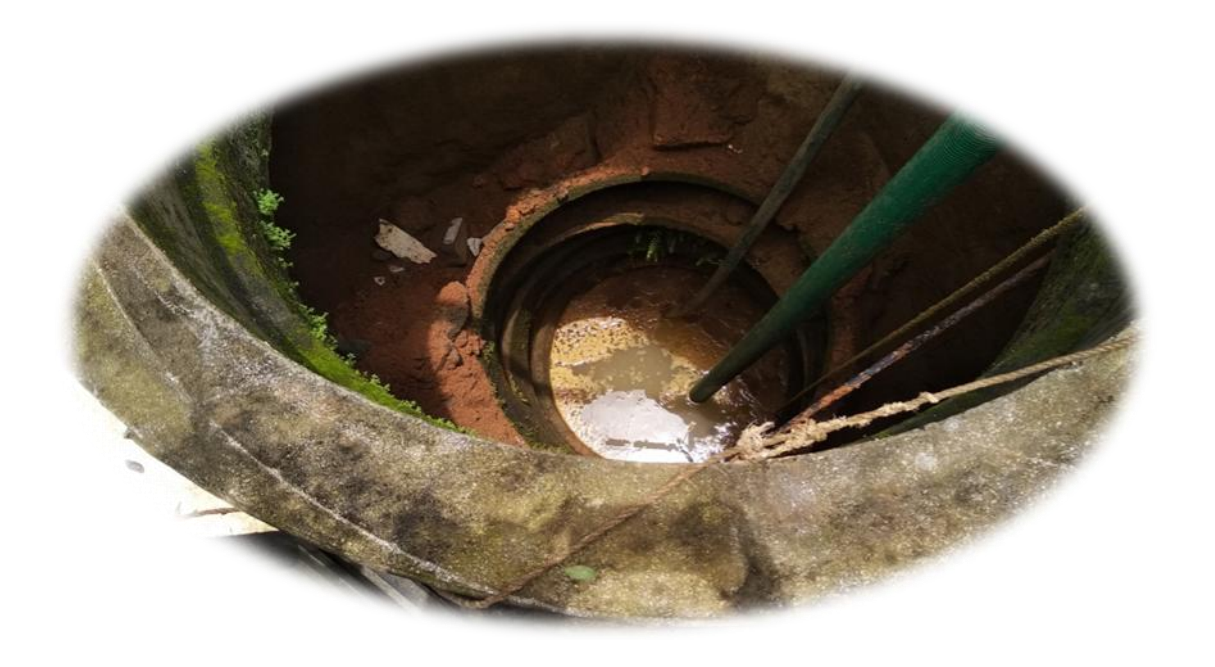
Destroyed Well due to Flood