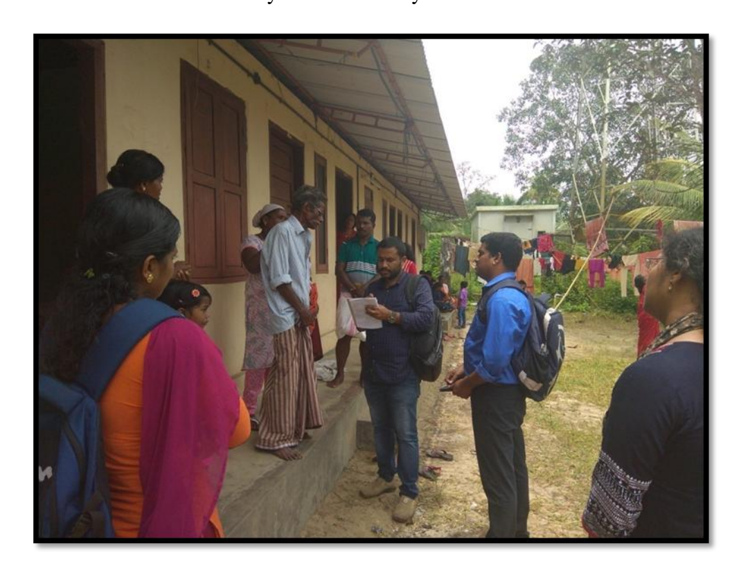
Visit to flood relief camp Interaction with inmates of relief camps