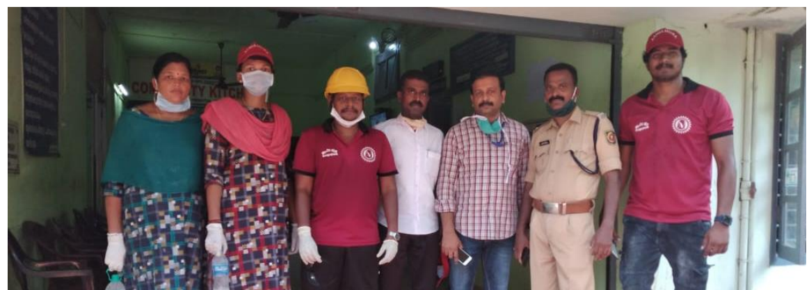
<u>Migrant Laborers:</u> Our Volunteers assisted the local self-bodies in taking count of the migrant laborers and also provided help in the distribution of food and essentials for them.