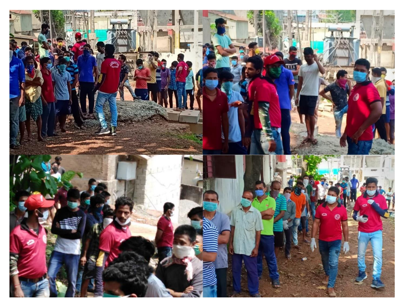
Work Period: 19/04/2020- 12/05/2020

Aapdha Mithra Volunteers have provided assistance in the Kottayam District Hospital by helping in ensuring social distancing in every OPs, providing assistance in the ticket counters, and also by providing food for needy. Our volunteers also donated blood for patients in emergency cases. The hospital superintend and the other doctors were really thankful for our help during this emergency.