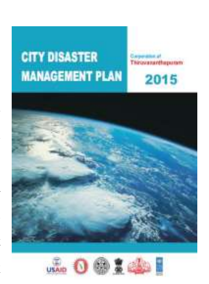
Link - https://sdma.kerala.gov.in/wp-content/uploads/2018/11/TVM-CDMP-2016.pdf

Proper planning must be done to avoid disasters in any city. In that respect, the City Disaster Management Plan is very important. Under this initiative, Thiruvananthapuram Municipal Corporation prepared this document with the support from KSDMA & UNDP. The City Disaster Management Plan establishes the framework that ensures the City is prepared to deal with any form of hazards. This document was prepared after a series of consultations and meetings and this has been approved by the Thiruvananthapuram District Disaster Management Authority (DDMA). This document also identifies disaster risk areas including scientifically prepared maps were included.