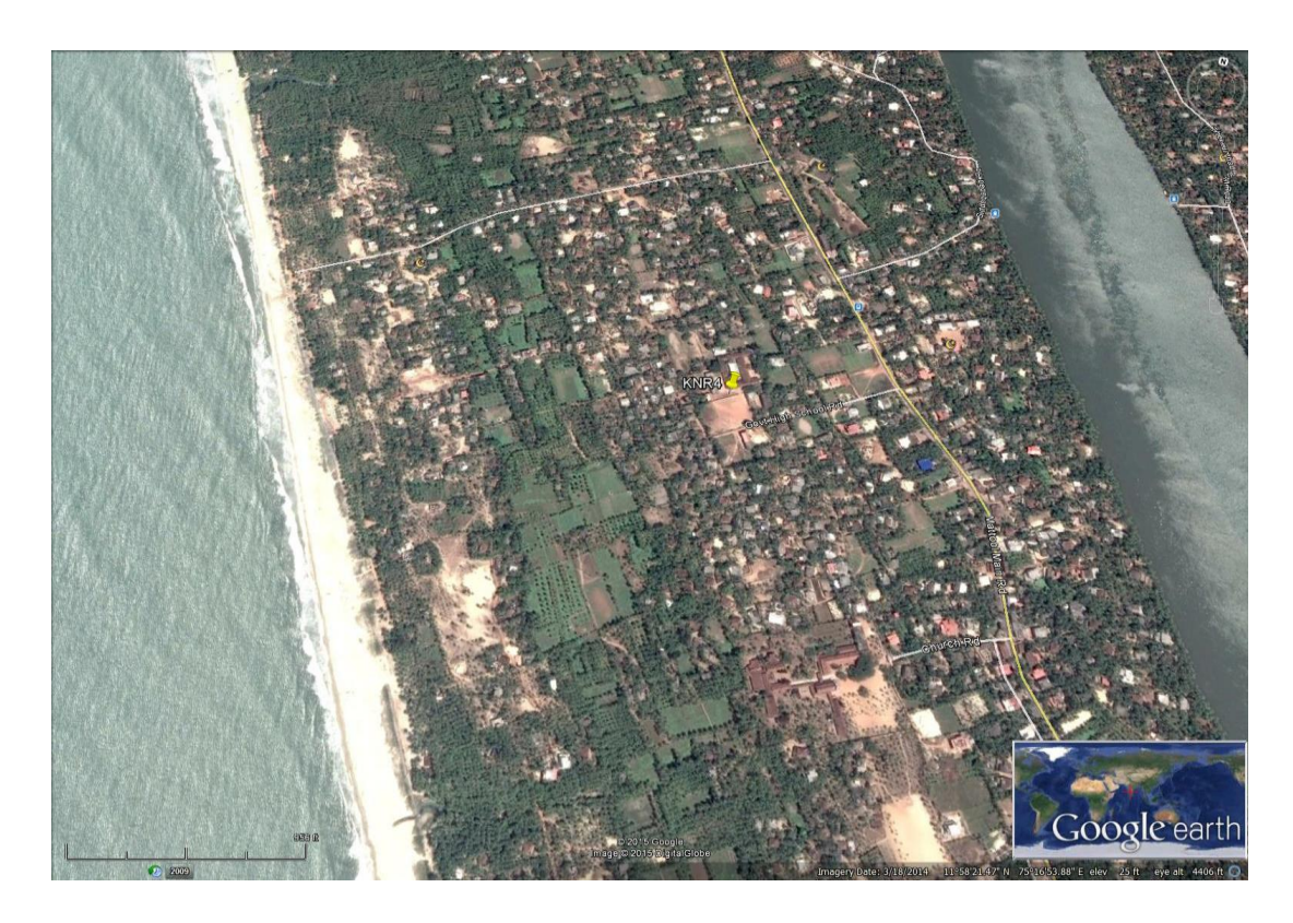
1. Aerial view of site at Matool 2. View of the site