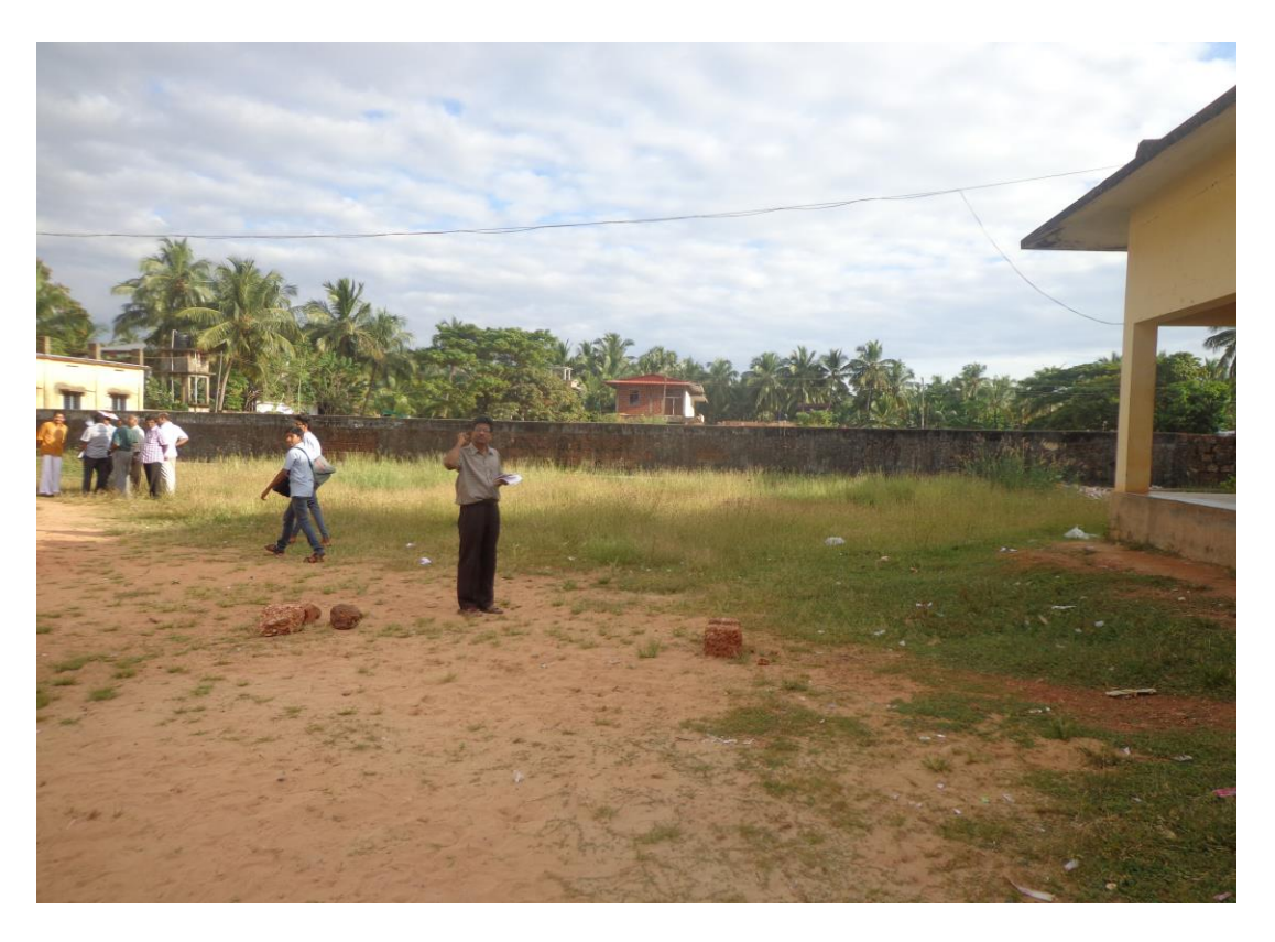
State Project Implementation Unit, NCRMP-Kerala