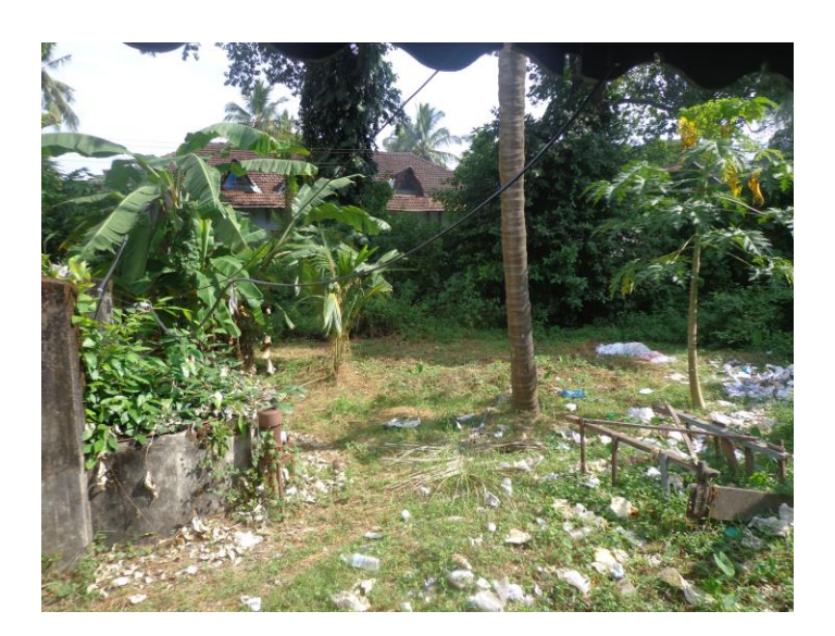
View of site

• The site is not suitable for construction of MPCS