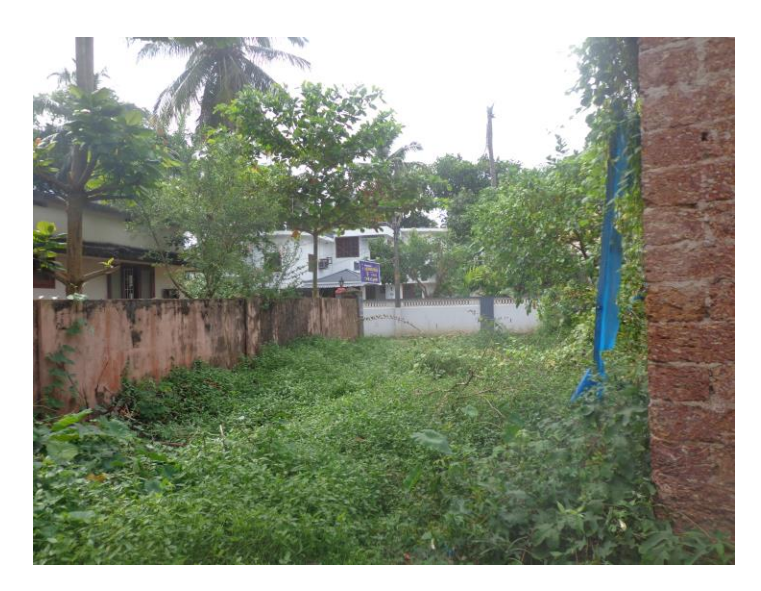
View of site