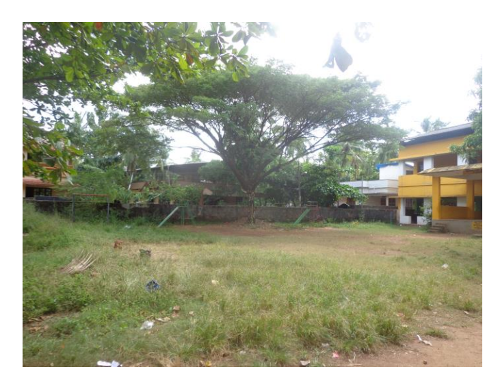
View of the site at Neerchal