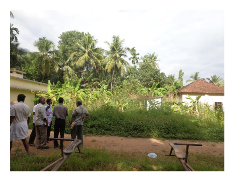
View of site at Kannapuram