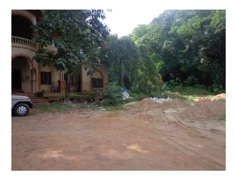
View of site

The site is not recommended for construction of MPCS