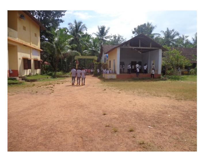
View of site at Muzhupilangad