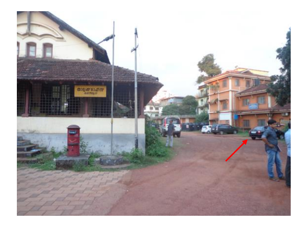
View of the site

• The site is not suitable for construction of MPCS