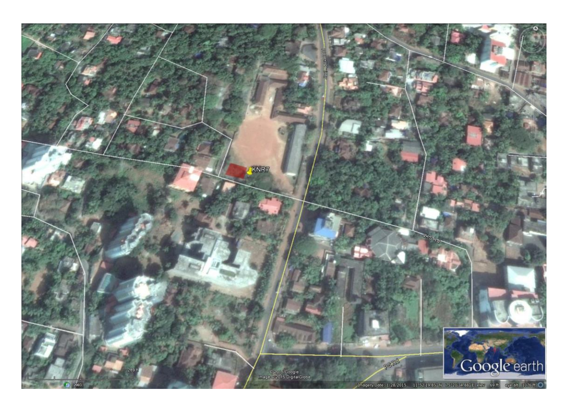
1. Aerial view of site at Chalad 2. View of the site