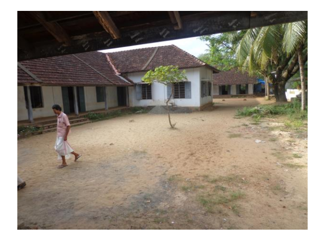
View of site at Matool