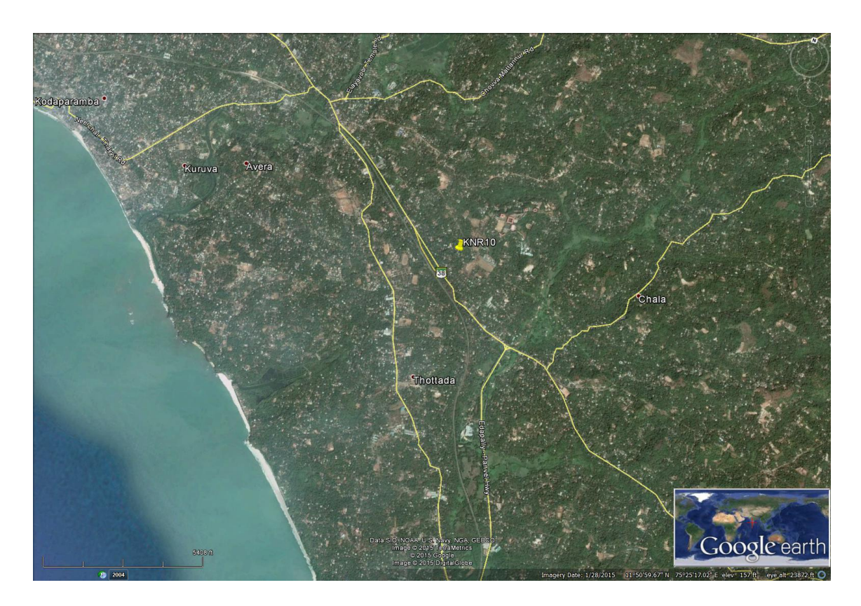
1. Aerial view of site at Ponniam 2. View of the site