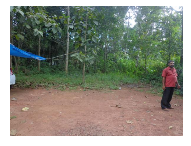
View of site at near Madai Village office