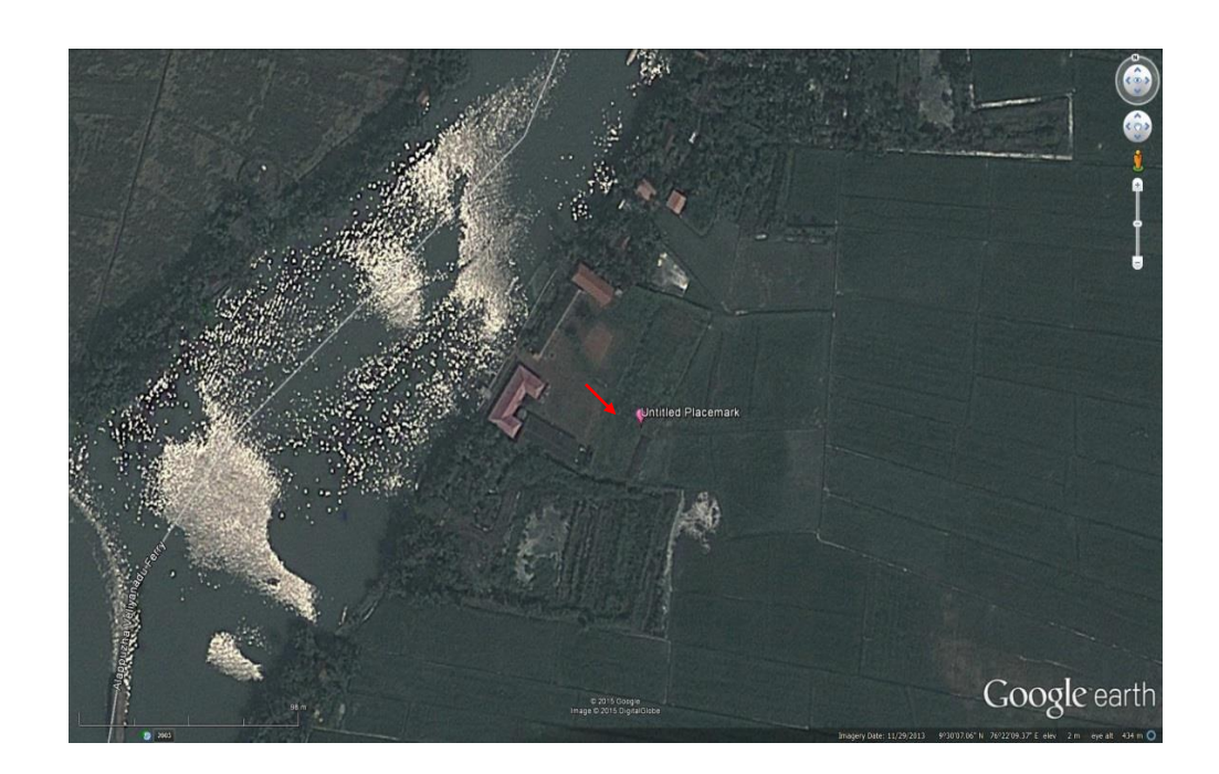
1. Aerial view of the site 2. View of the site at Kainakari