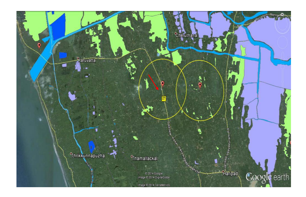
{\bf 1.} Ae {\it rial \, view \, of \, the \, site \, 2. \, \, View \, of \, the \, existing \, shelter \, in \, \, Kumarapuram \, Village}