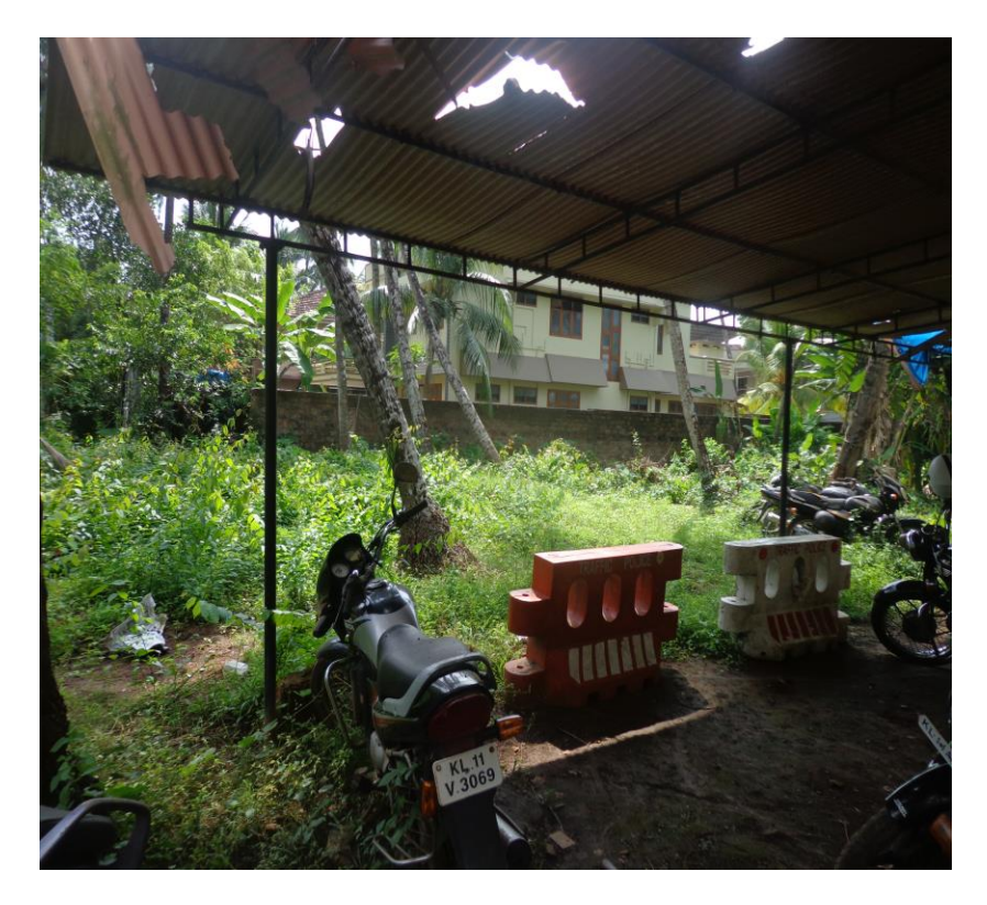
3: View of site. Parking shed of Police station be can be seen