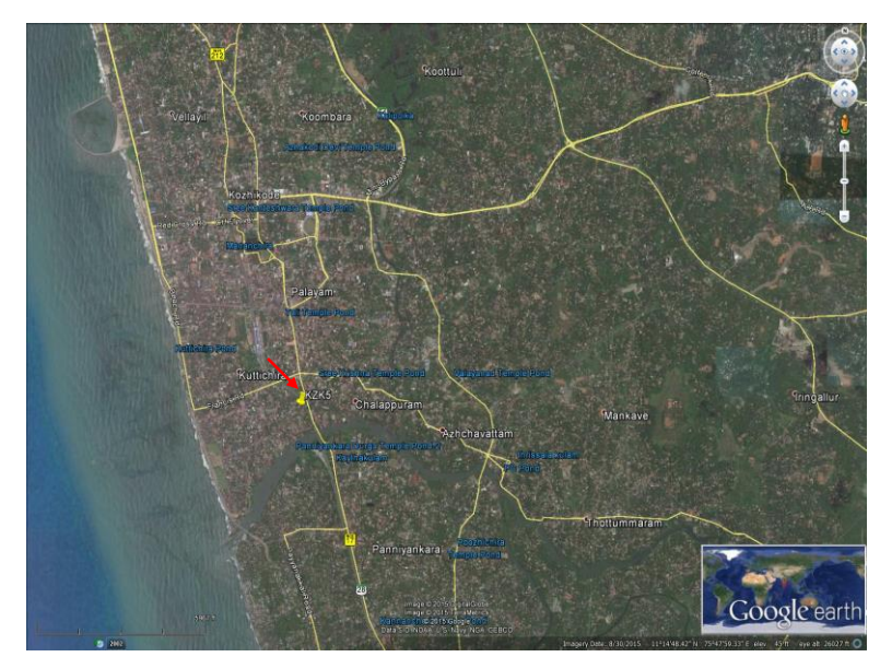
1 and 2 Aerial view of the site at Nagaram