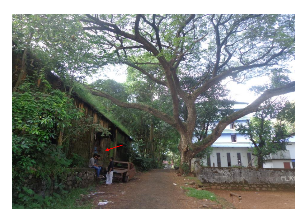
4. View of the site from access road