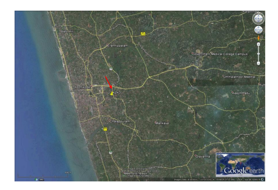
1 and 2:Aerial view of the site near Taluk office.