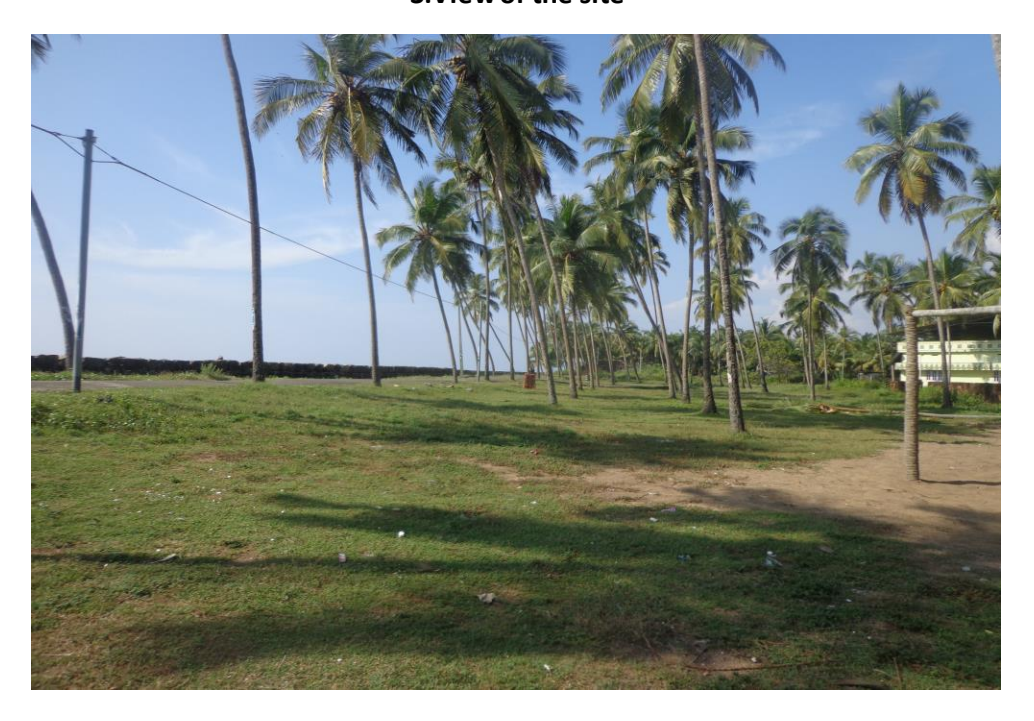
4:View from of sea from the site