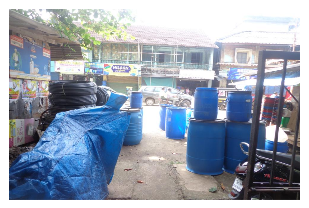
4: View of main road from the site