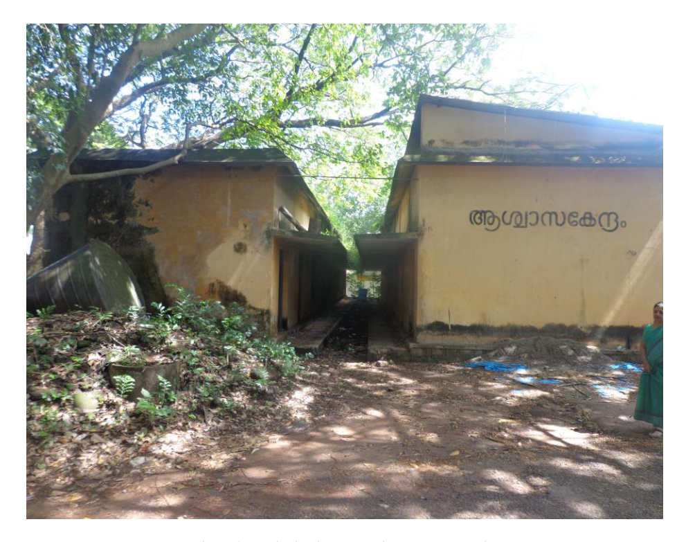
3. Dilapidated Shelters in the proposed site