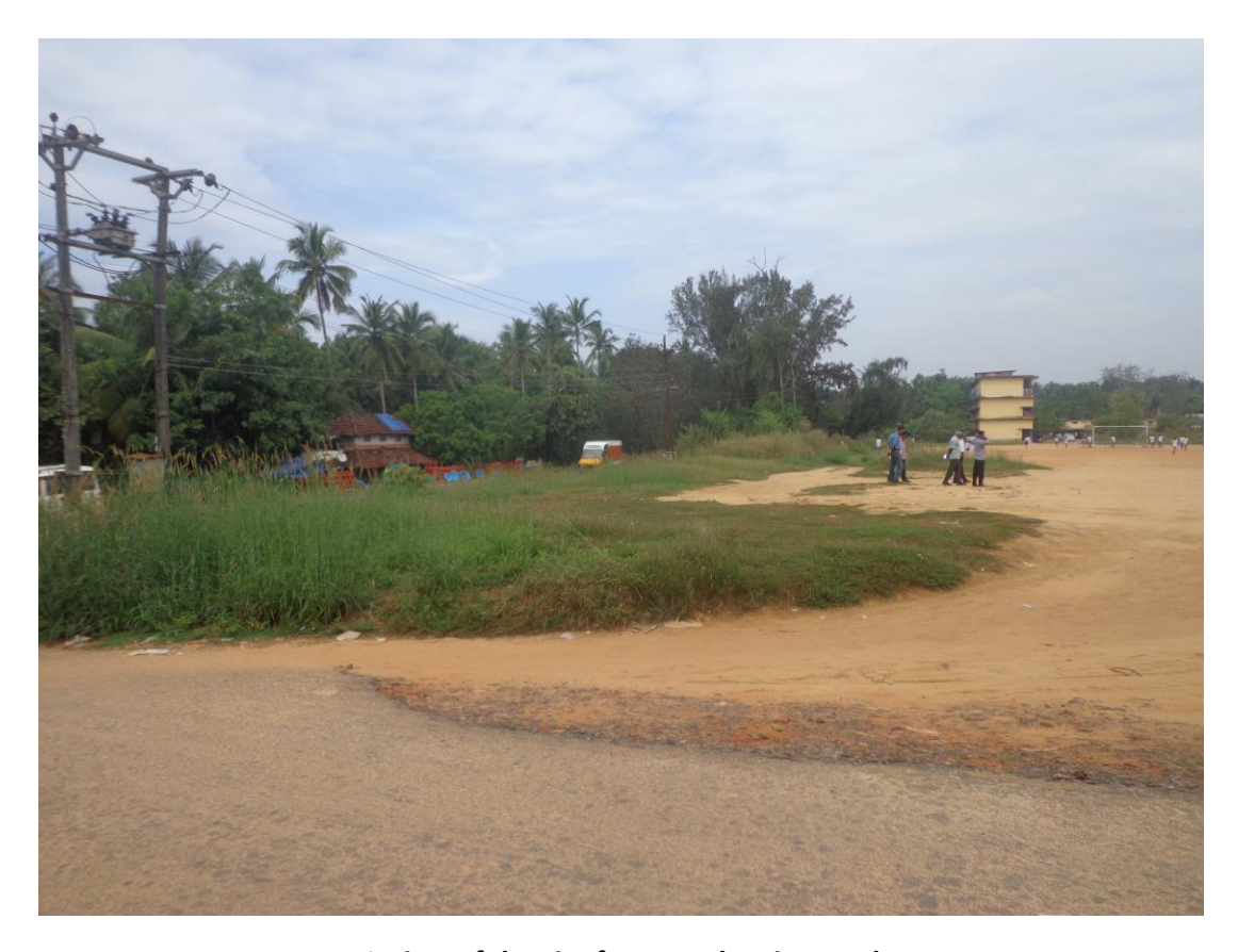
3. View of the site from an abutting road