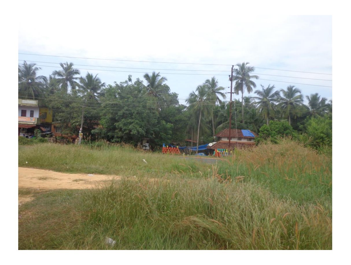
3.View of the site at Payyoli