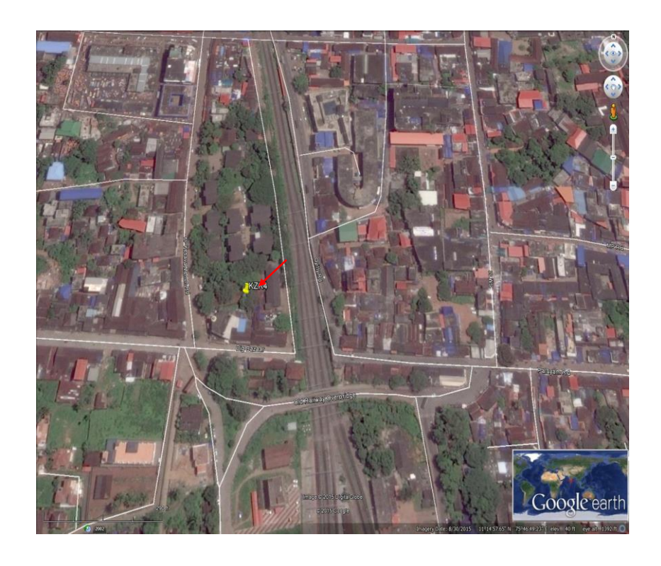
State Project Implementation Unit, NCRMP-Kerala