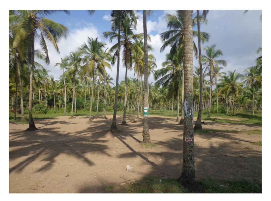
3:View of the site