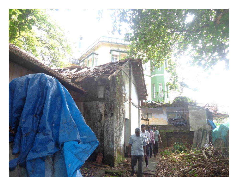
{\bf 3:} View \, of \, dilapidated \, building \, in \, the \, site. \, Mosque \, \, near \, to \, site \, can \, \, be \, seen. \,