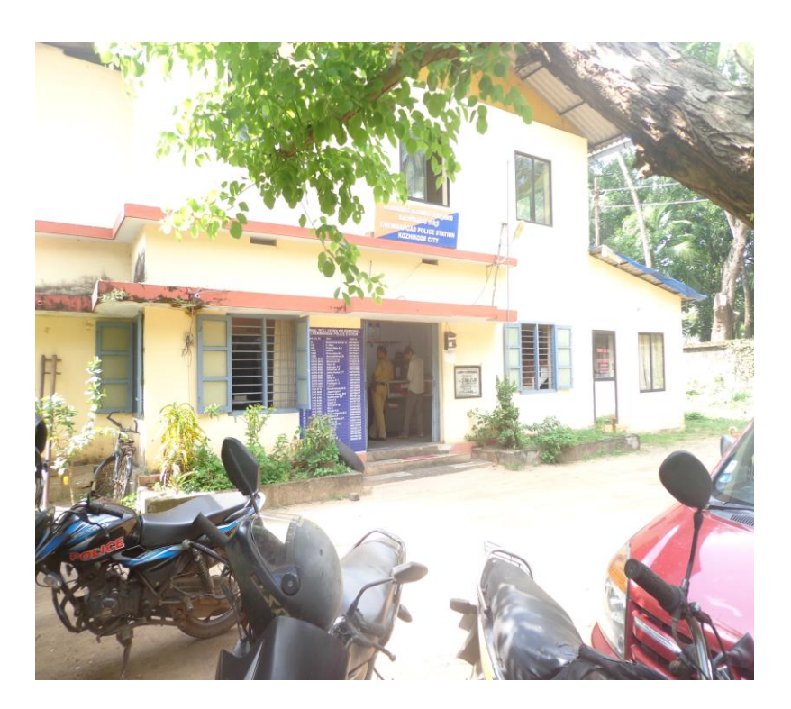
4: Police station adjacent to the site