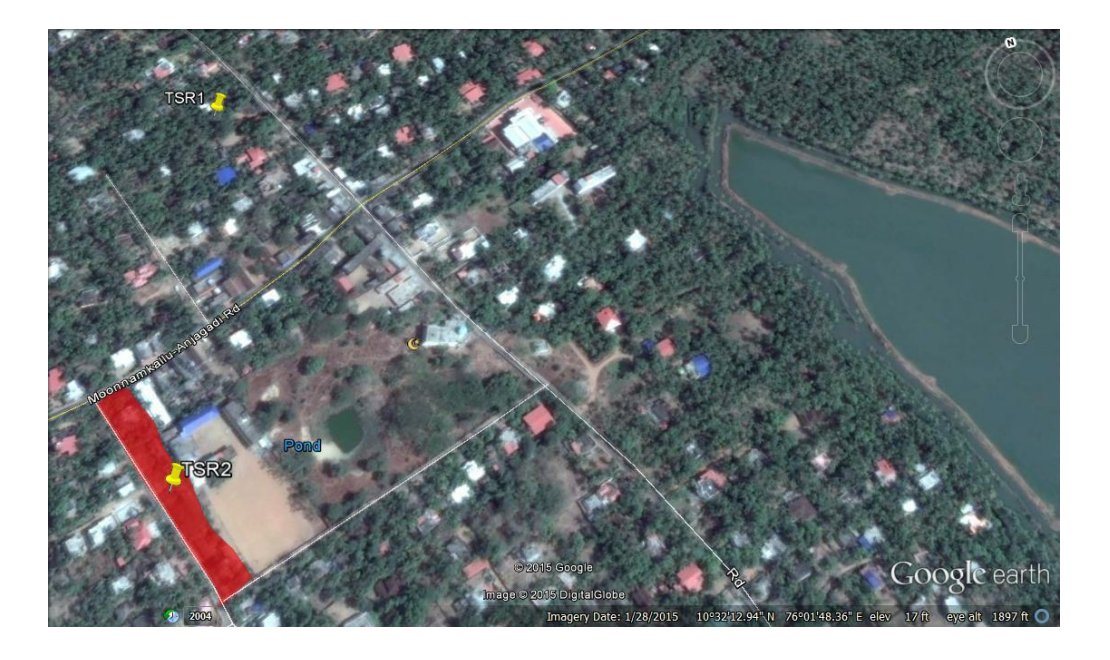
Aerial view of site