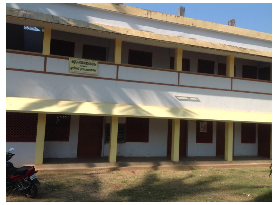
Building existing in the site