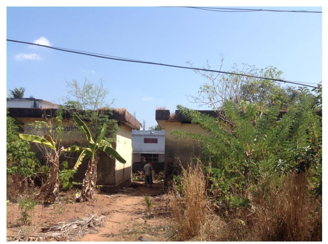
View of the site