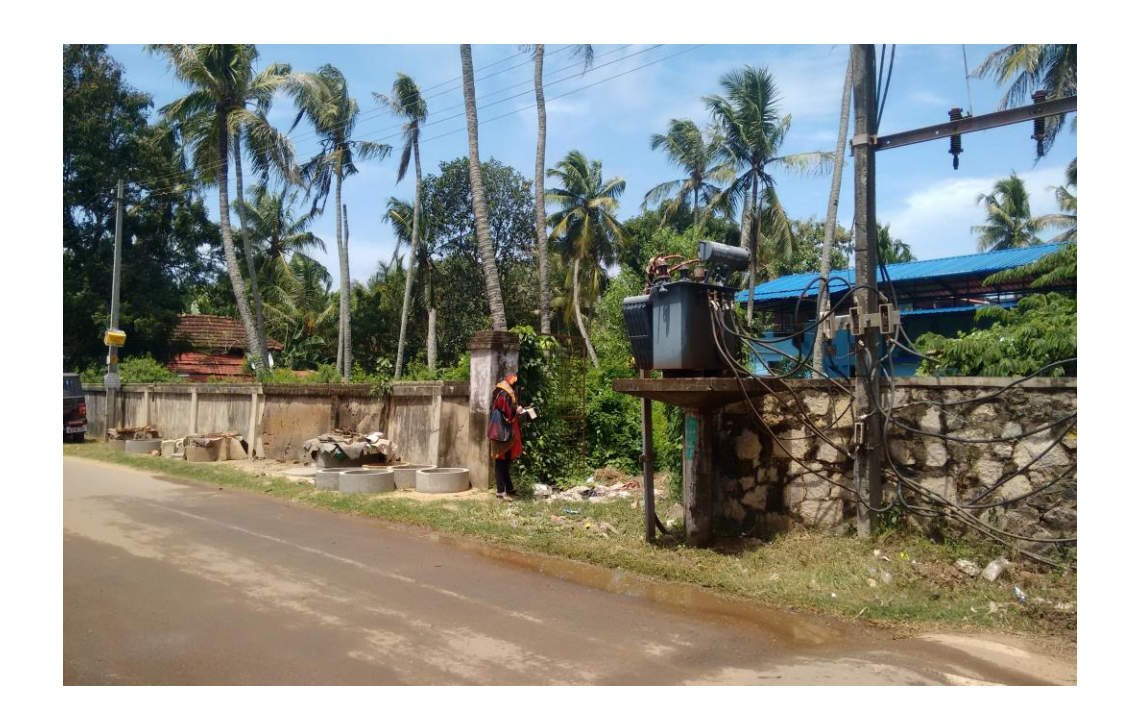
1. View of the site from Approach road