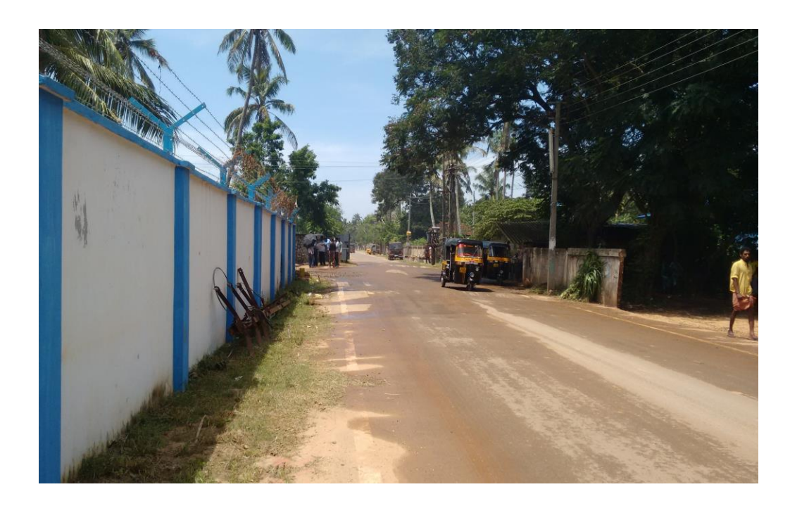
2. View of approach road