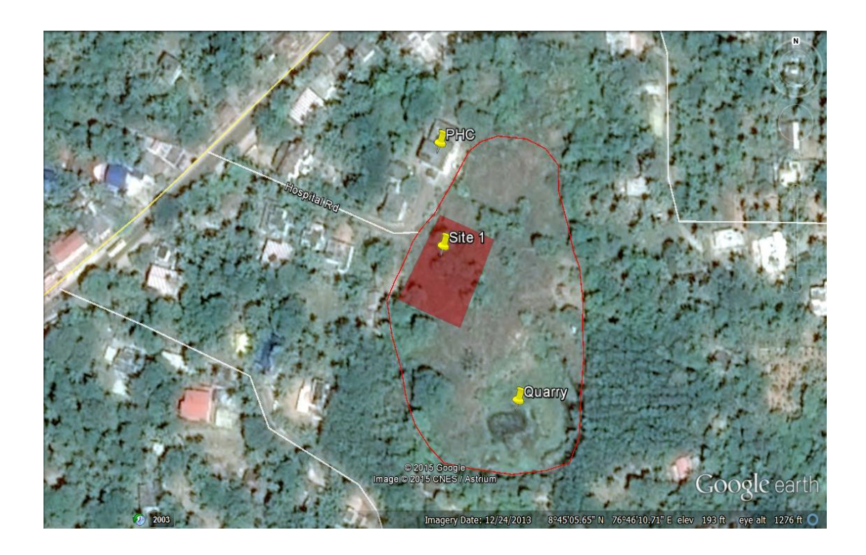
1. Aerial view of the site (The outlined area is the proposed site)