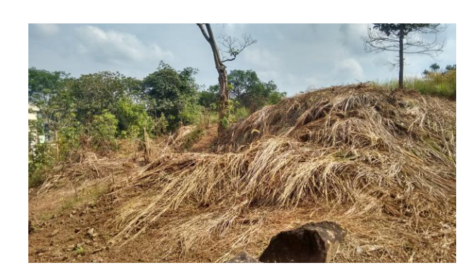
3 and 4. View of the sit. Thick cover of vegetation and scattered trees can be seen

2. Top portion of the site. Rocks and hilly terrain of the plot seen