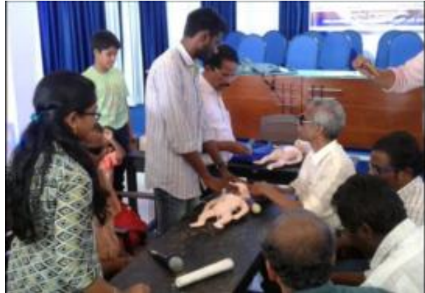
Visually Impaired being trained in CPR, Kottayam

As a precursor for the training of persons with disabilities at the district level, two ToT trainings were also held in partnership with Inter University Centre for Disability Studies (IUCDS), Mahatma Gandhi University, Kottayam in the year 2017. IUCDS facilitated the district level training.