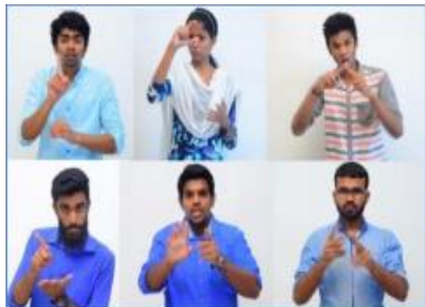
Sign language messages by interpreters from NISH

Hazard profile of the State, Disaster risk reduction, disaster survival skills, First Aid skills etc, are the sessions facilitated during the trainings and hands-on sessions are included for better learning. Authority intends to train about 3000 persons with disabilities through these trainings. Certificates are also distributed to the participants.