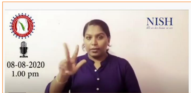
Early Warning Messages in sign language

Early Warning is very important to prepare for disasters. Under this project, the State Disaster Management Authority provides warning messages in sign language for the people with hearing impairment. These sign language videos are made available to the people through KSDMA's website and facebook page at