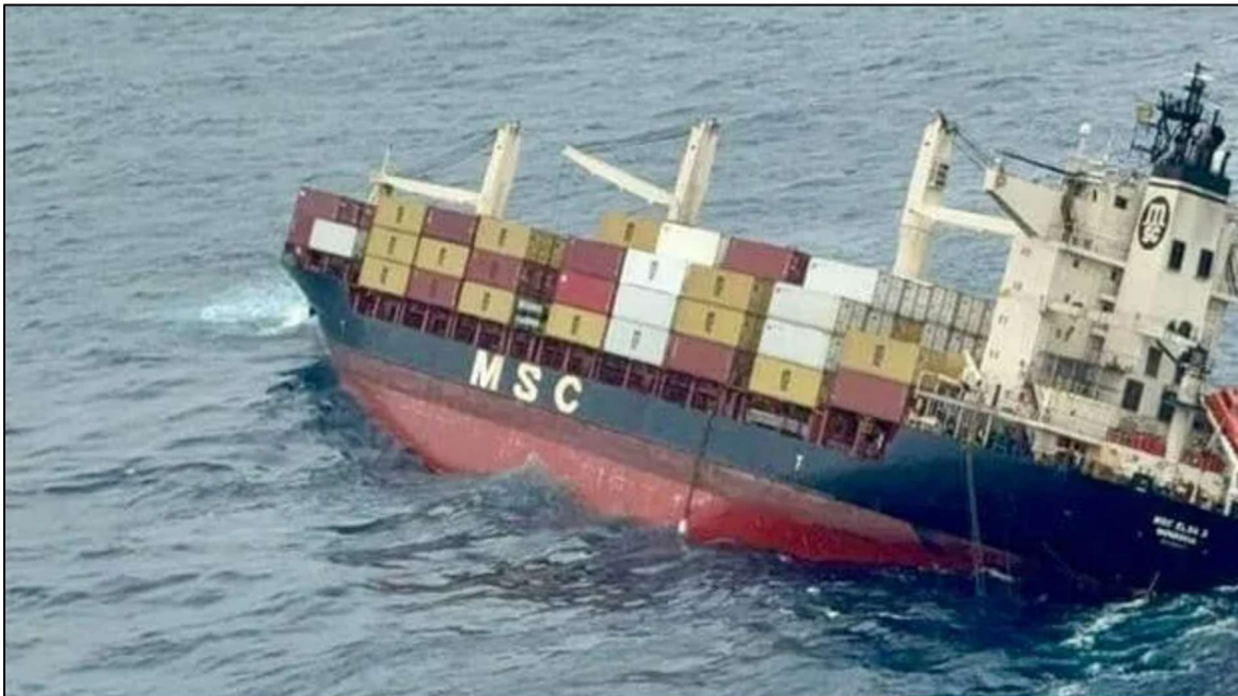
Figure 1: MSC ELSA 3

On 24 May 2025 at approximately 1300 hrs IST, the container vessel MSC ELSA 3, operated by MSC Ship management Ltd., developed a severe starboard list while enroute from Vizhinjam to Cochin, about 30 nautical miles southwest of Kochi Port. By 1515 hrs IST, the list had increased to 30 degrees and stabilized, with no further progression observed.