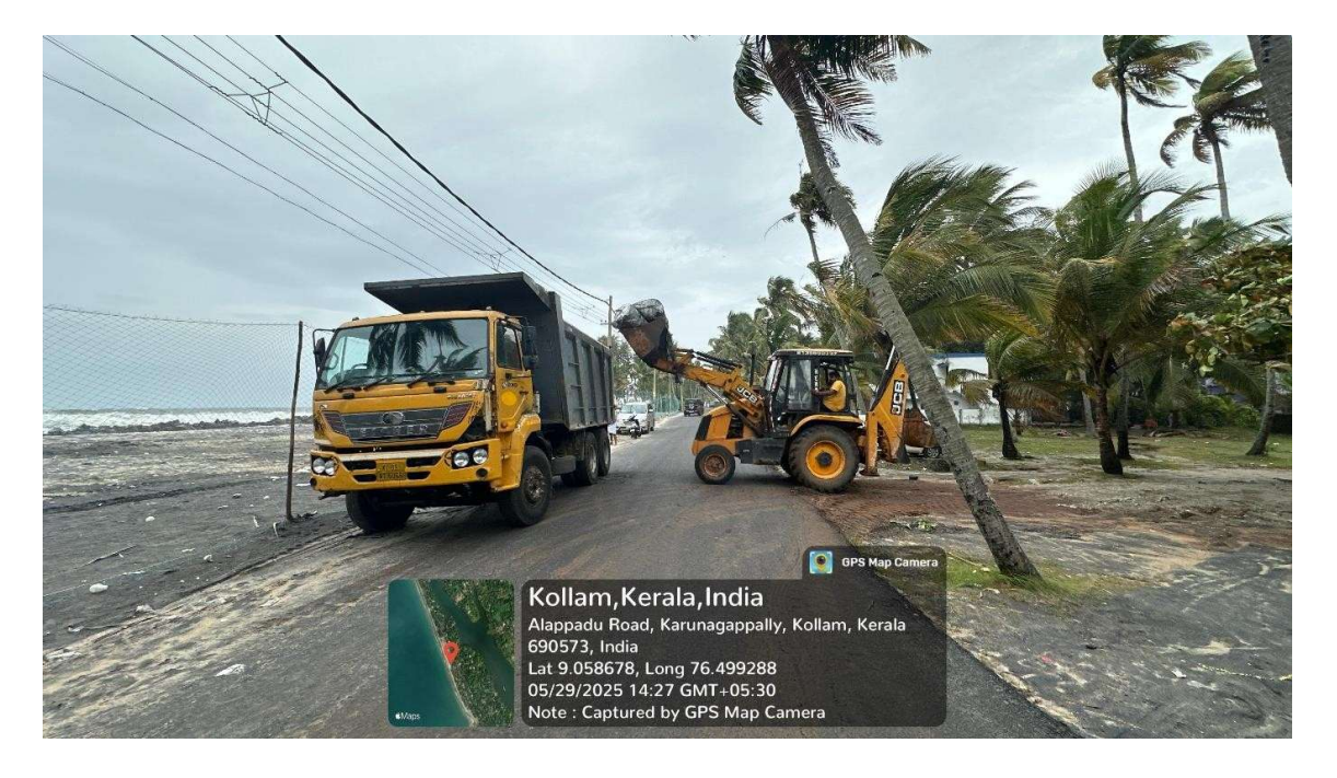
Figure 3: Shifting of fabric rolls from container was initiated at Alappadu Village

Activation of divers is being pressed upon by the stakeholders for plugging the source of oil from the vessel, however, action is awaited due to the pendency of multibeam survey. ROV deployment for the survey of the vessel is also being pushed by the DGS to salvors. Exploration for platform-based ROV use is ongoing and salvors are also exploring the possibility of engaging a DSV post multi beam survey.