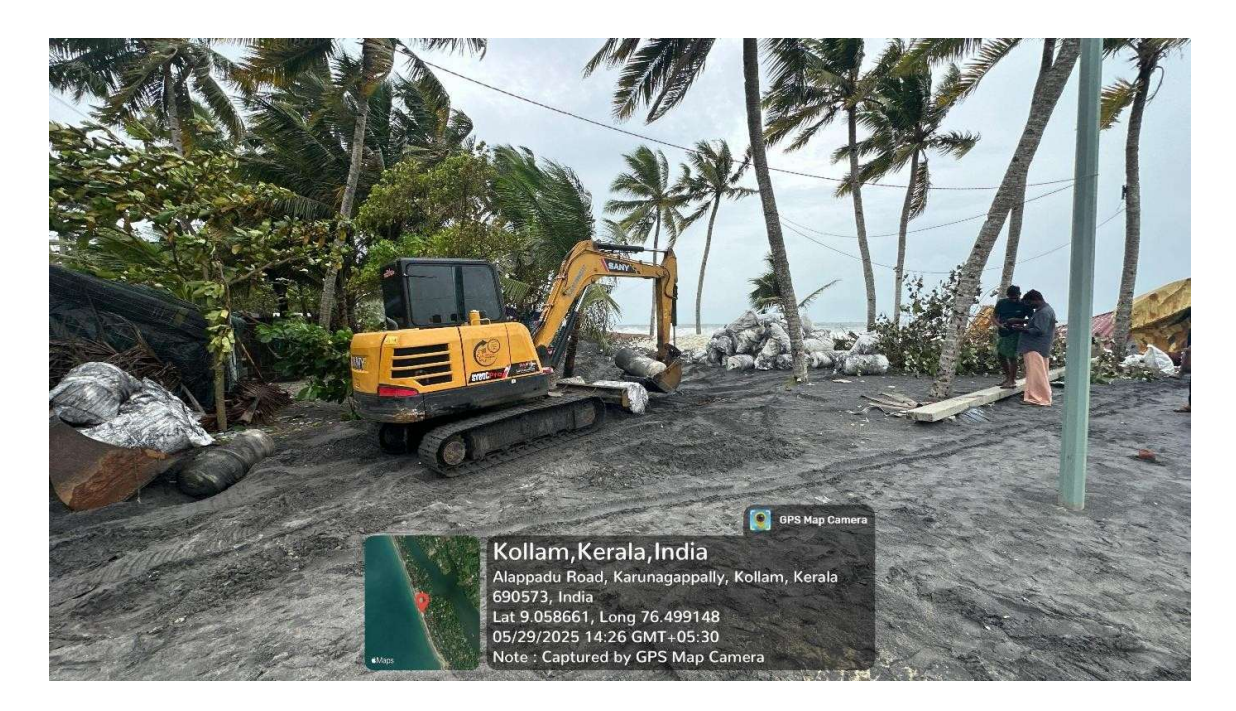
Figure 2: Shifting of fabric rolls from container was initiated at Alappadu Village

The shifting of fabric rolls from container was initiated at Alappadu Village. The operation is being conducted in the presence of customs authorities, and the rolls will be transported to Kollam Port under customs surveillance.