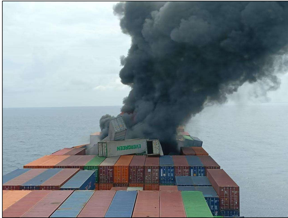
Figure 2: Fire and explosion onboard

The ICG and the Indian Navy responded swiftly, deploying three Dornier aircraft—two by ICG and one by the Indian Navy—equipped with life rafts for aerial support and situational assessment. Additionally, two ICG surface ships have been dispatched and are expected to arrive at the vessel's position within three hours. A total of five ships have been deployed by the ICG and are expected to reach the scene between 1430–1600 hrs IST. Further, Indian Naval Warship operating in the area has been diverted and expected to reach the location at approximately 1700 hrs.