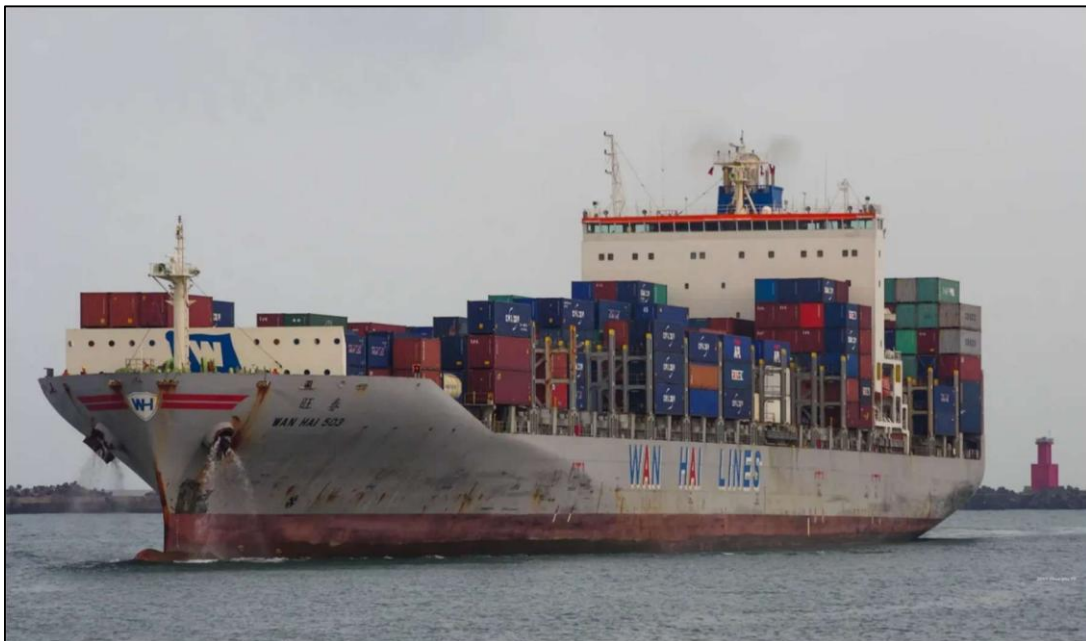
Figure 1: Vessel WAN HAI 503

On 09 June 2025, an incident was reported at approximately 0950 hrs of a Singapore flagged container vessel Wan Hai 503 (IMO Number: 9294862), under direct management of Wan Hai Lines and currently en route to Nhava Sheva, experiencing a container explosion resulting in a significant onboard fire . The vessel was located at Lat. 11°37.6'N, Long. 074°37.4'E, approximately southwest of the Indian coastline, 44 nautical miles (nm) from Azhikkal, Kerala. The fire has engulfed the entire vessel and is currently adrift.