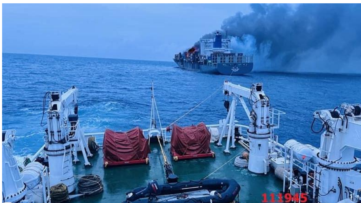
Figure 2: Connection of tow line

The onboard fire has been partially stabilised, with approximately 40% of the fire brought under control. Firefighting efforts continue in the forward cargo holds with boundary cooling and foam-based suppression being carried out by ICG vessels Samudra Prahari and Samarth , while Rajdoot , Arnvesh , Abhinav and ICGS 513 are engaged in search and rescue operations. Salvage Master observations confirm ongoing hydrocarbon release, with potential involvement of the fuel tanks. The vessel remains afloat but unmanned, and is currently drifting southeast at a steady pace, SE'ly X 1 kt.