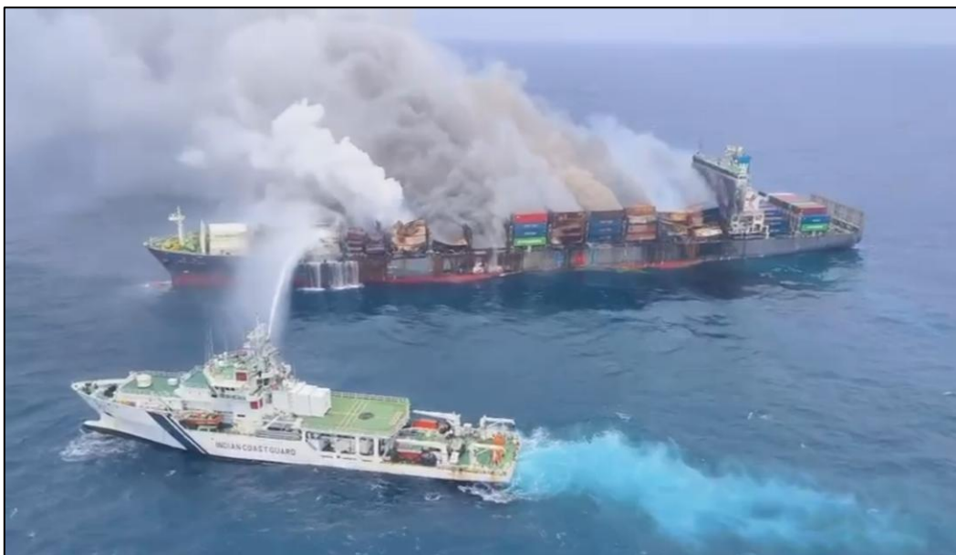
Figure 1: 11 June 1430 hrs

ICG helicopters successfully deployed 05 salvage personnel (03 salvage personnel from MERC and 02 Air rescue divers of ICG) onboard. Additional foam and DCP supplies continue to be mobilized; approximately 3000 litres of foam are currently available, with another 10,000 litres en route. DCP (1000 kg) procured earlier by MERC has been routed to Beypore air base and received by ICG for operational deployment.