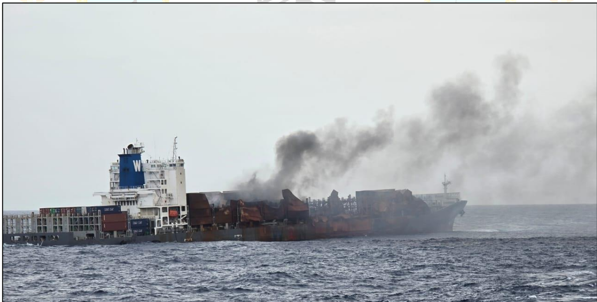
Figure 2: Condition of the vessel on 28 June 2025

The vessel remains in a structurally compromised but stable condition, with primary risks stemming from the persistent smouldering fire in Cargo Hold No. 4, the residual flooding within the engine room, and unpredictable weather patterns. High winds and swells have severely limited boarding operations, complicating firefighting and dewatering efforts. The exposed opening on the forward section of Cargo Hold No. 4 continues to channel airflow into the hold, exacerbating flare-ups and making containment difficult.