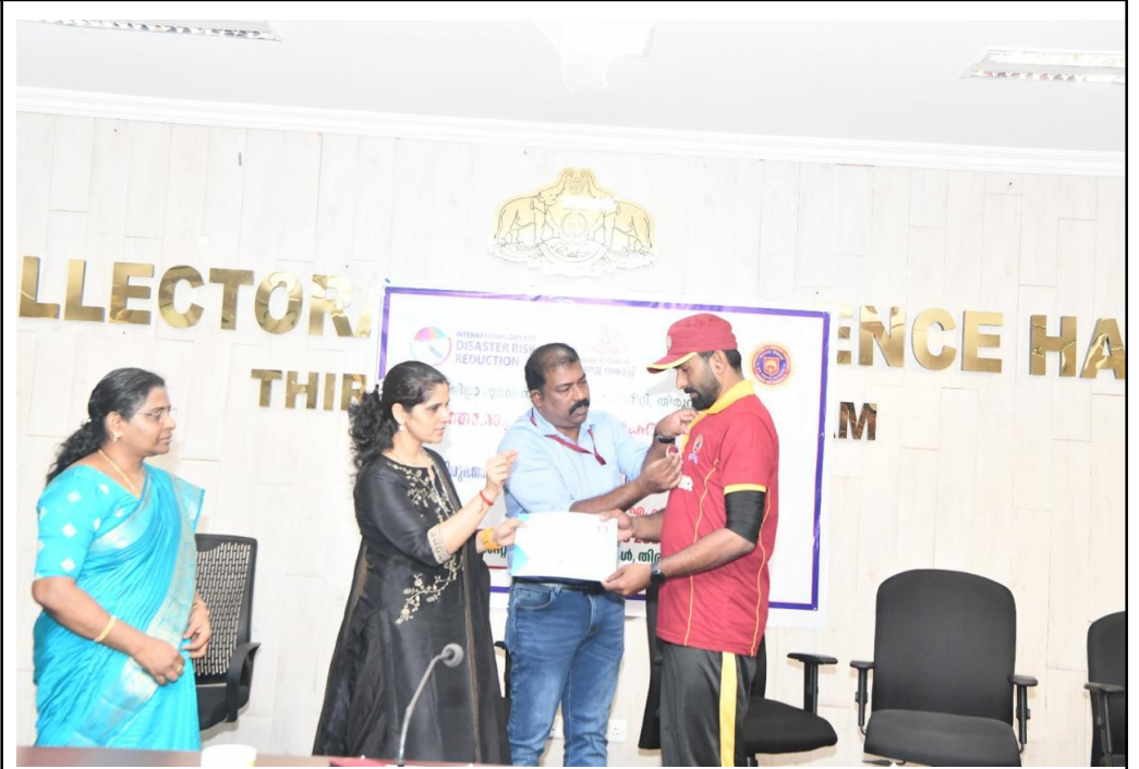
Honoring Aapda Mitra volunteers by the District Collector, District Fire Officer and Deputy Collector (DM)