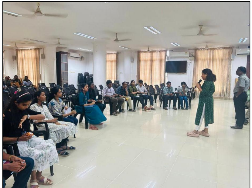
Students participated in the Interschool Quiz Competition